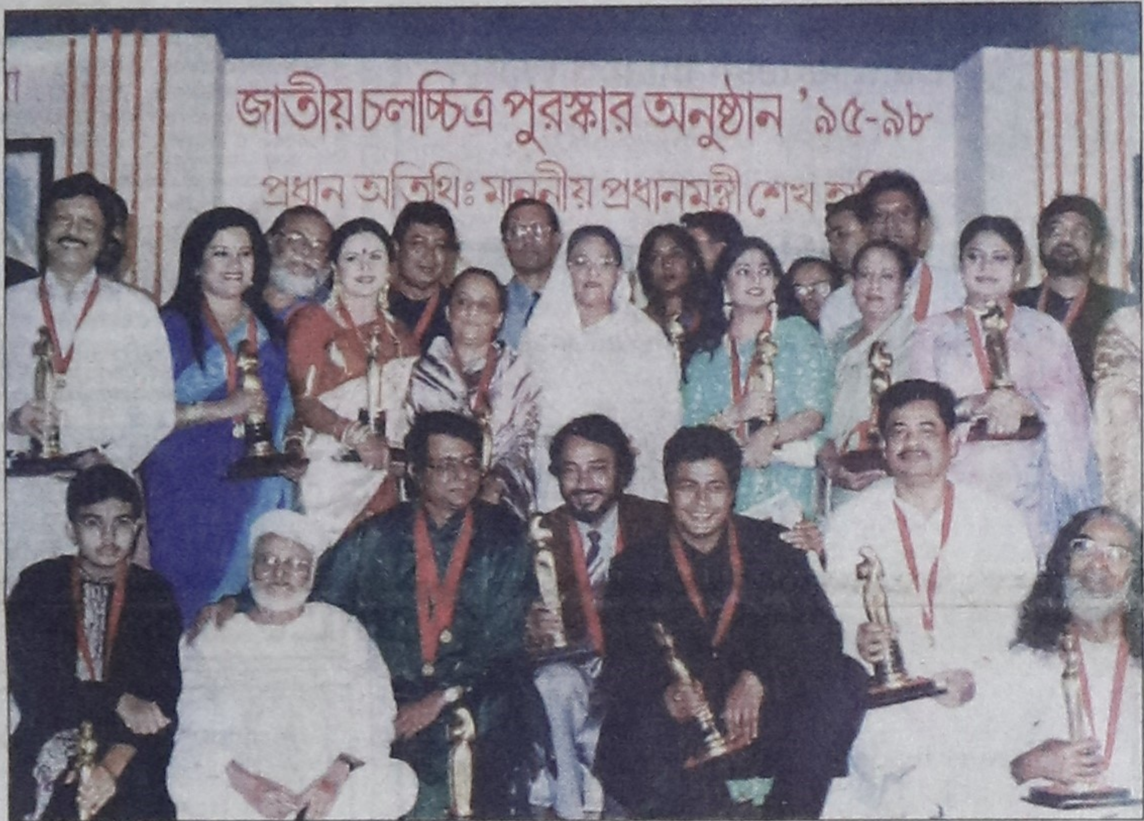
Prime Minister Sheikh Hasina poses for a photograph with the winners of National Film Awards 1995-98 at Osmani Memorial Hall in the city yesterday.