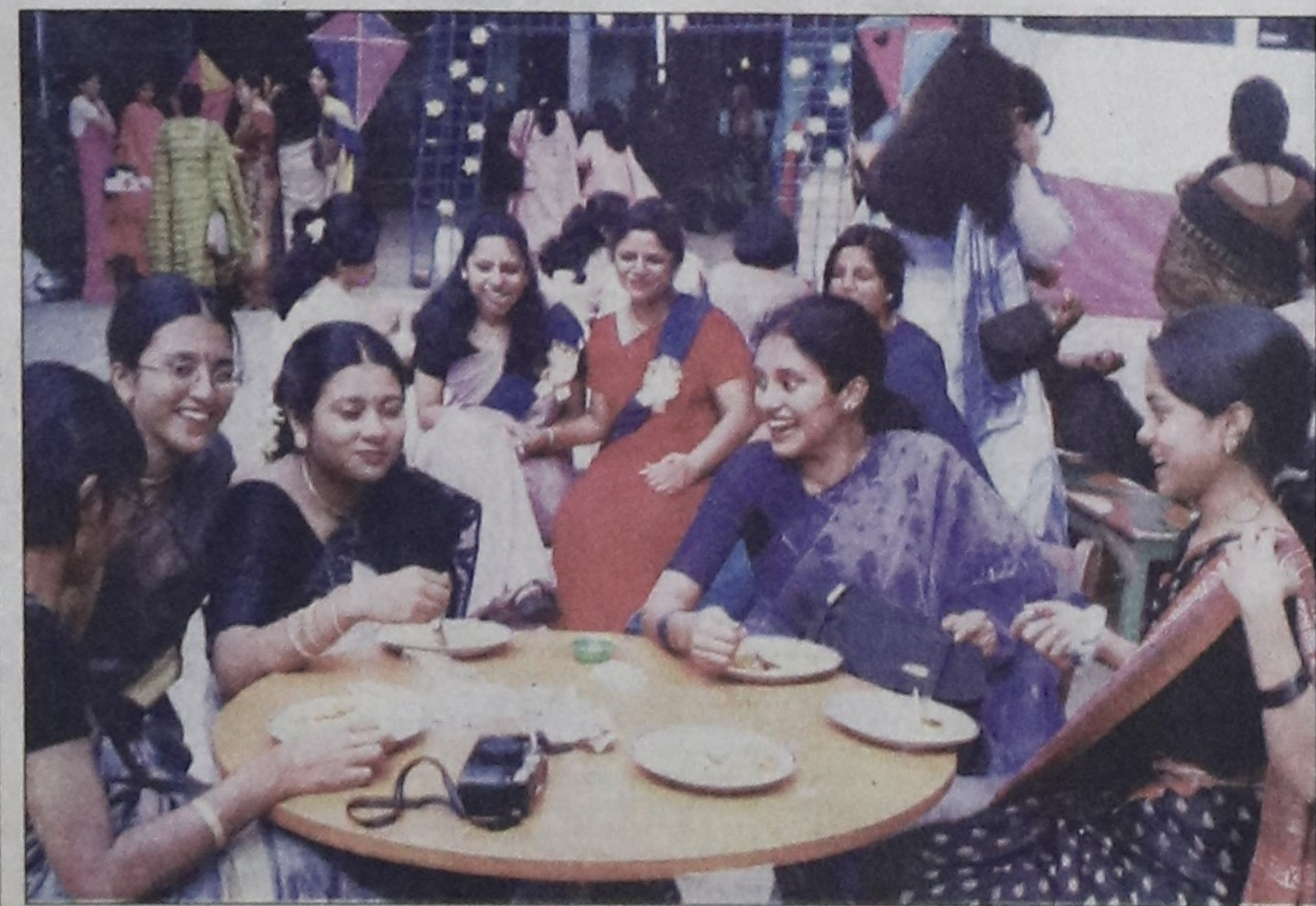
A get-together of the students of Holy Cross College marking the 50th founding anniversary of the institution was held on the college campus yesterday.