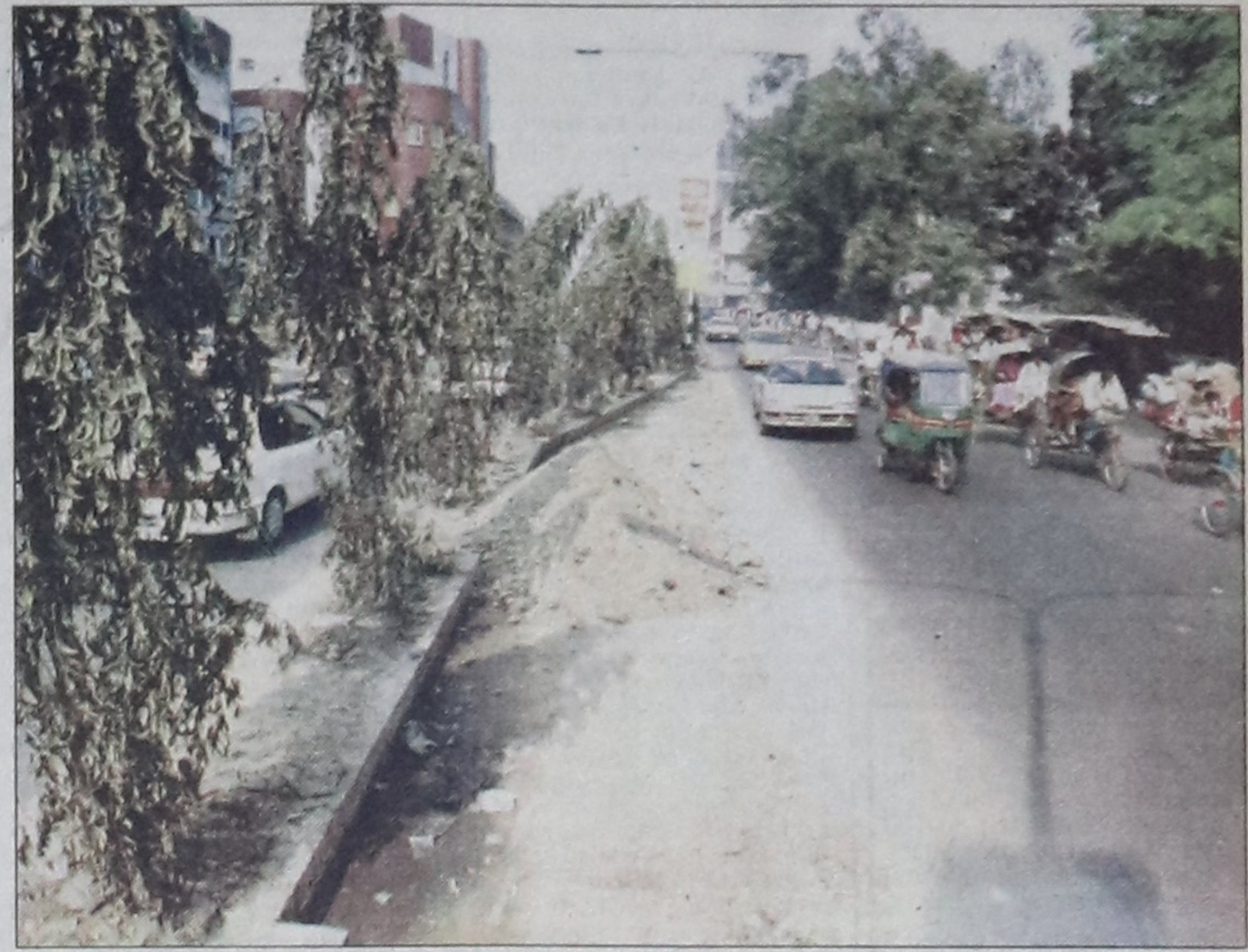
Trees, first uprooted and then replanted on the relocated divider on Mirpur road to ease traffic jam, have all perished within a week.