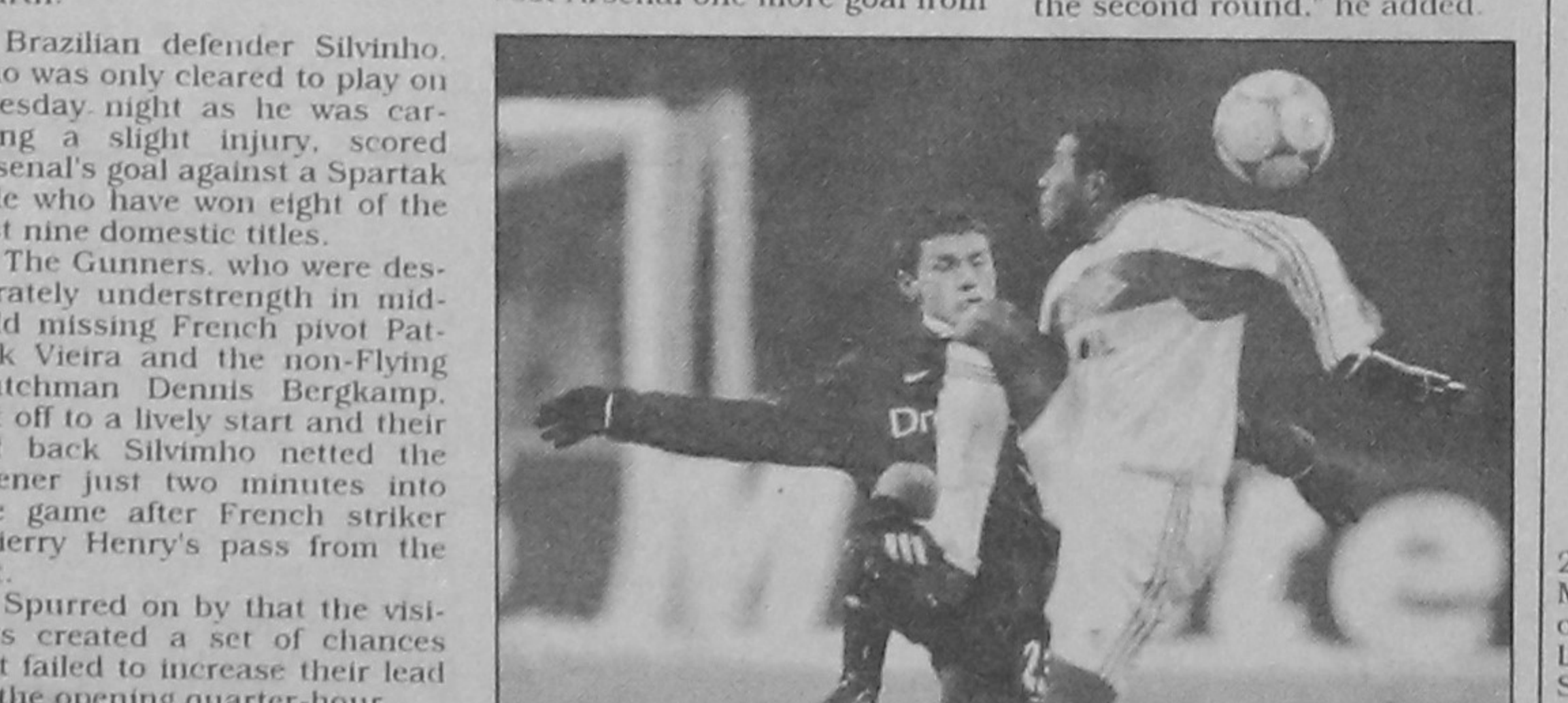
Arsenal's Argentine international Nelson Vivas (L) and Spartak Moscow's Jerry-Christian Tchuisse locked in a tussle at Moscow on November 22.

MOSCOW, Nov 23: Russian champions Spartak Moscow came from a goal down to stun English Premiership giants Arsenal 4-1 in front of 84,000 delirious fans here on Wednesday in their Champions League Group C second round match played in freezing conditions. Three of the recently crowned champions goals came from their Brazilian strikers Marcao, who grabbed two, and Luis Robson, while captain and Russian international midfielder Vegor Titov scored the fourth. Brazilian defender Silvinho, who was only cleared to play on Tuesday night as he was carrying a slight injury, scored Arsenal's goal against a Spartak side who have won eight of the last nine domestic titles. The Gunners, who were desperately understrength in midfield missing French pivot Patrick Vieira and the non-flying Dutchman Dennis Bergkamp, got off to a lively start and their left back Silvinho netted the opener just two minutes into the game after French striker Thierry Henry's pass from the left. Spurred on by that the visitors created a set of chances but failed to increase their lead in the opening quarter-hour. Spartak then got back into the game and Marcao levelled when he fired home past Austrian keeper Alex Manninger from 15 yards out having seized on Silvinho's headed clearance. Marcao put the Russians into the lead seven minutes into the second-half when Cameroon midfielder Jerry-Christian Tchuisse crossed the ball in and Robson headed down past