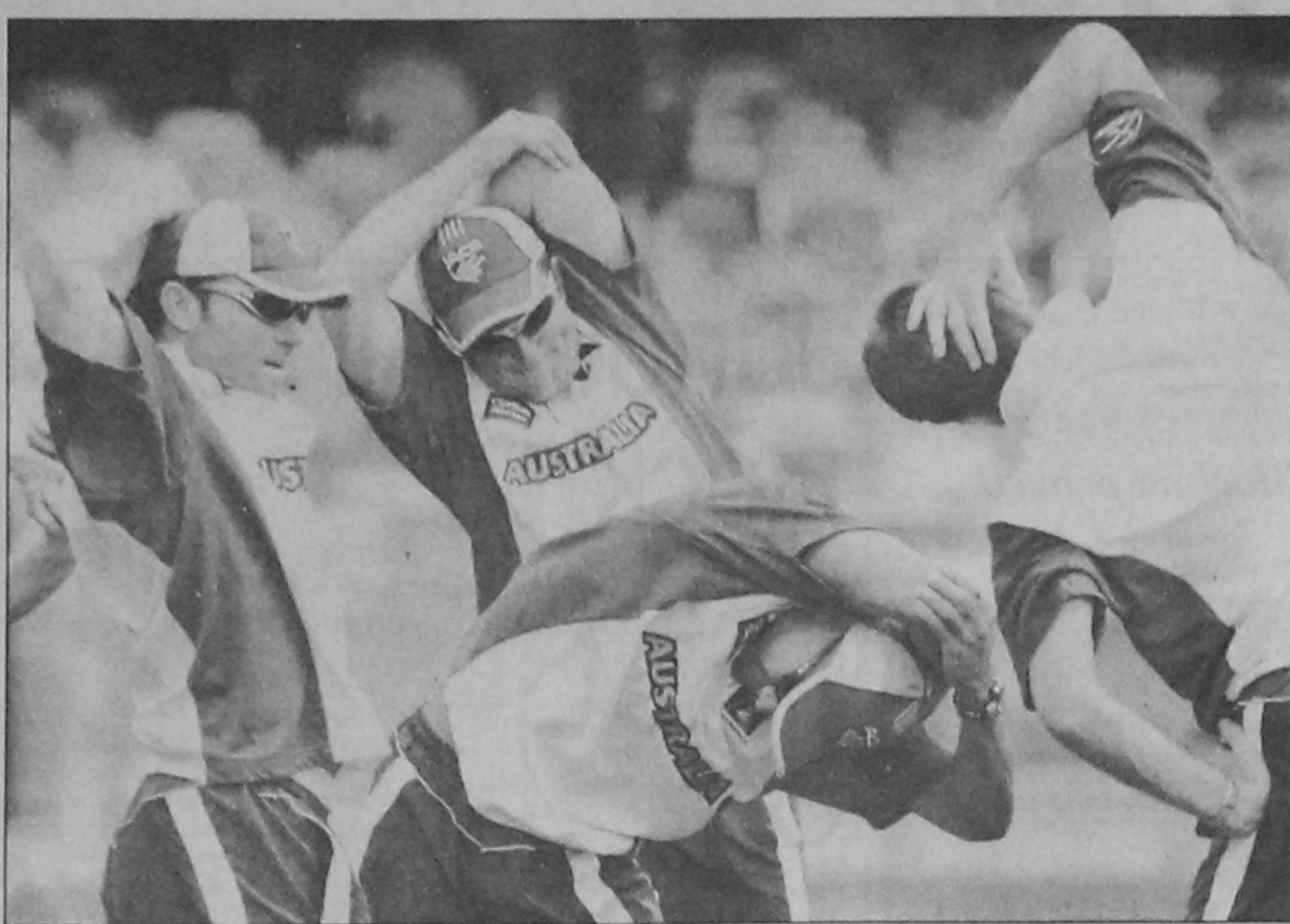
Australian cricketers (L-R) Michael Slater, Stuart MacGil, Ricky Ponting and Glenn McGrath limbering up during a practice session at Brisbane yesterday.