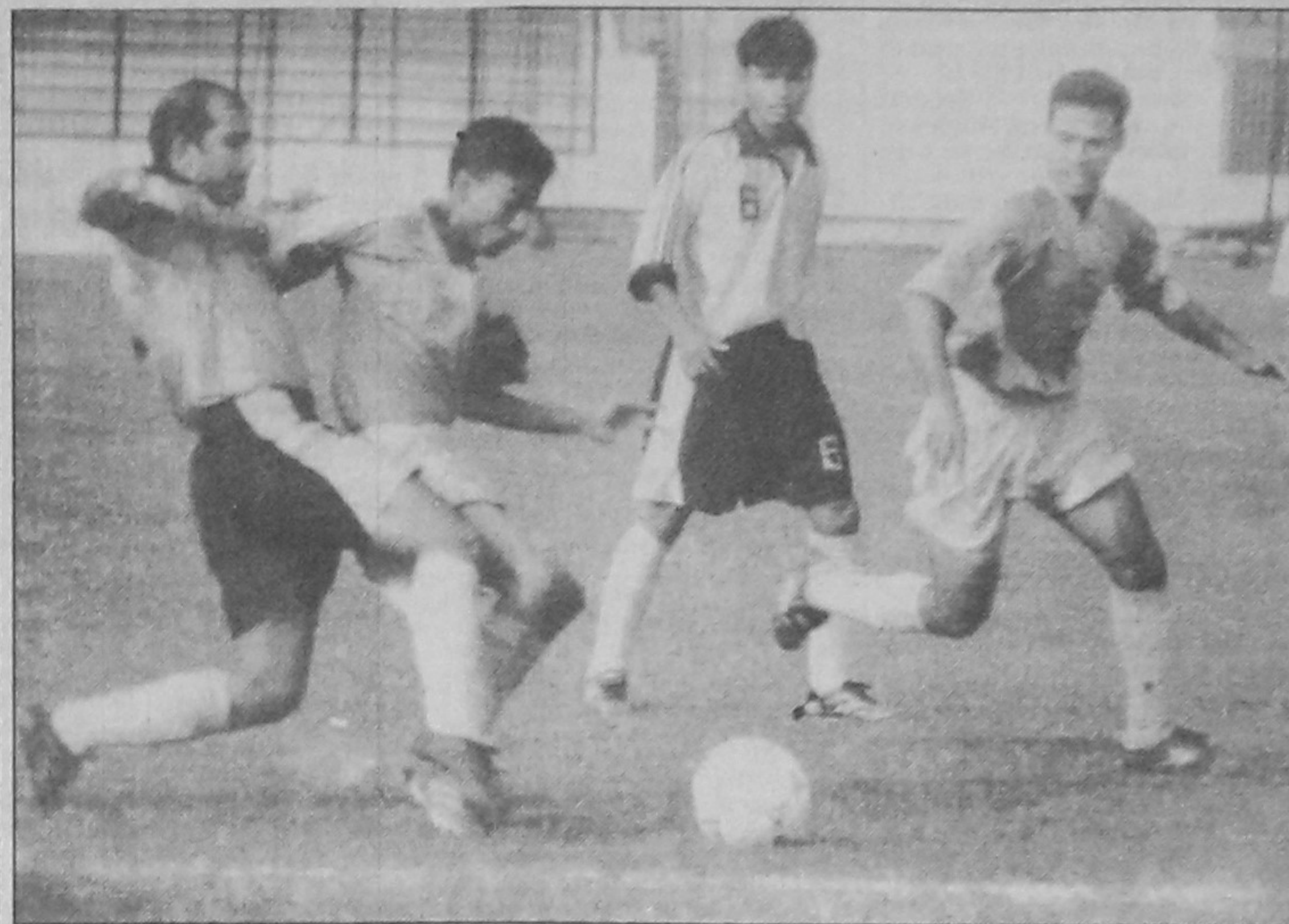
Action from yesterday's National Bank Premier Division Relegation League fixture between Dhanmondi and Farashganj at the Bangabandhu National Stadium.

"We loved talking to him and hearing his insight and proving that most of the time he was right about what he said."