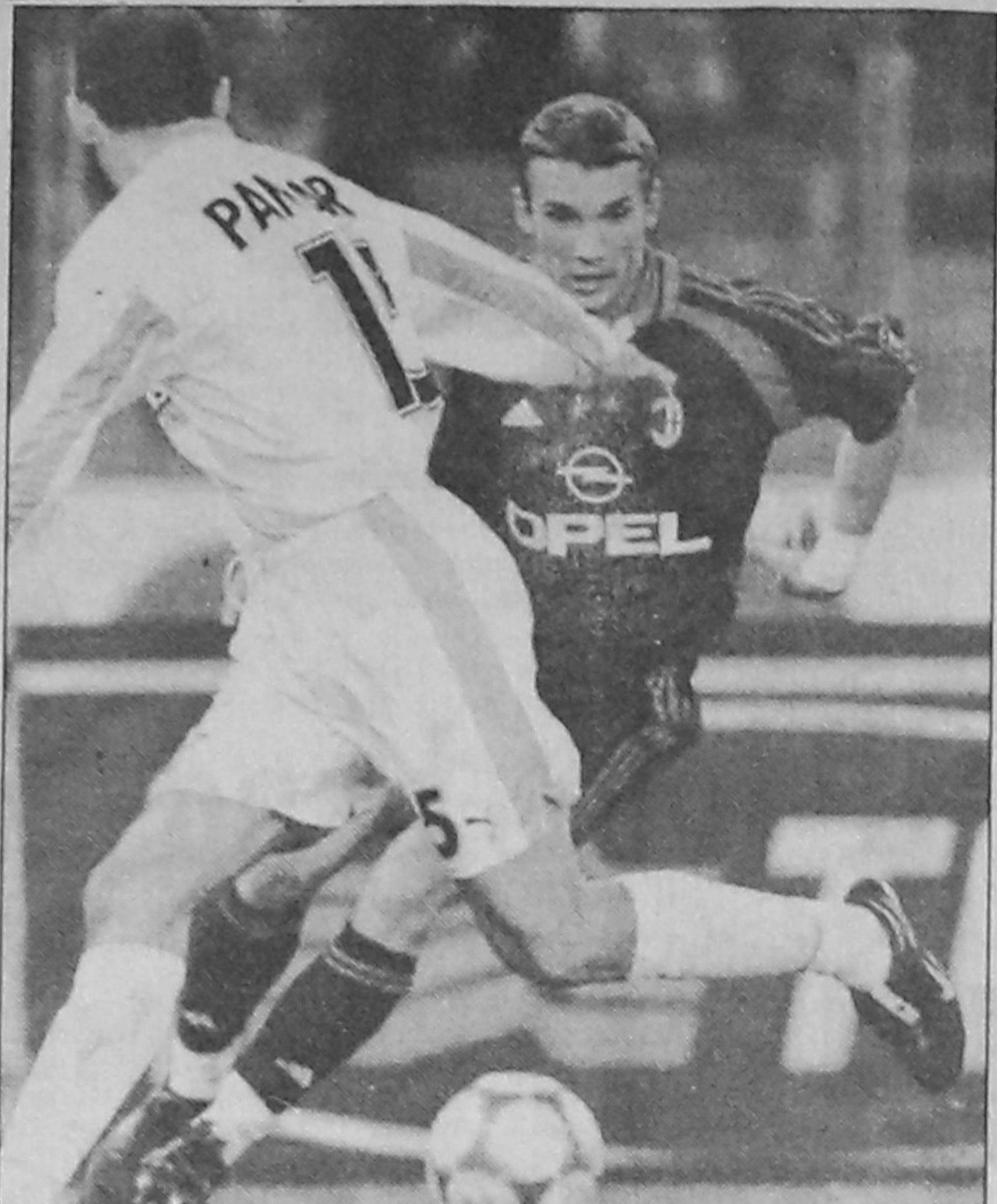
AC Milan's Ukrainian goal machine Andrei Shevchenko (R) in action against Lazio in their Serie A encounter on November 18.

But despite the explosive opening, Lazio struggled to gain control of the game with Dario Albertini orchestrating the game for the visitors, assisted by some lively movement