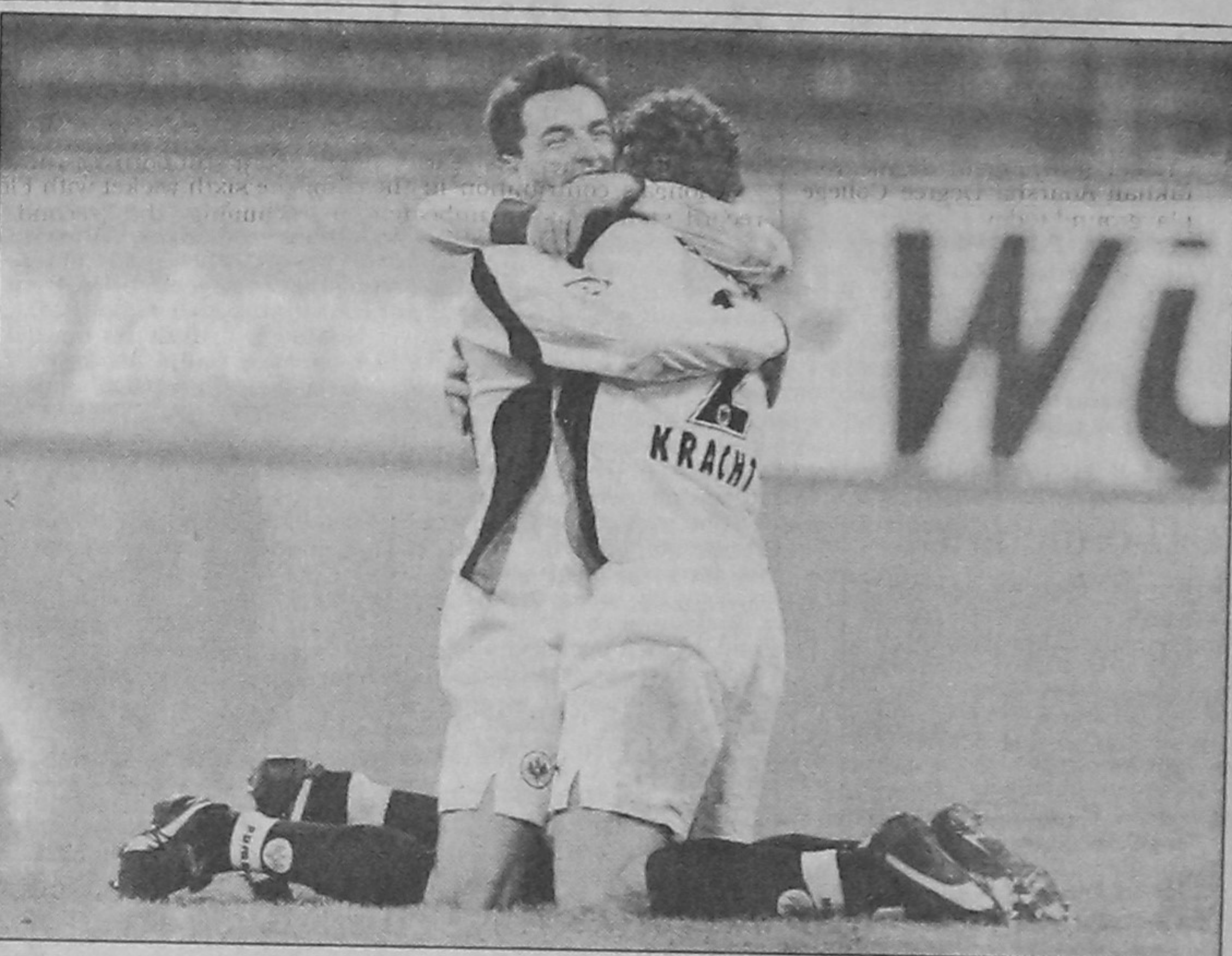
WE'VE DONE IT: Alexander Schur (L) and Torsen Kracht of Eintracht Frankfurt embrace each other after their team's shock win over giants Bayern Munich in the Bundesliga on November 18.

Down at the bottom Derby beat Bradford 2-0 with goals from Malcolm Christie and Rory Delap securing the points.