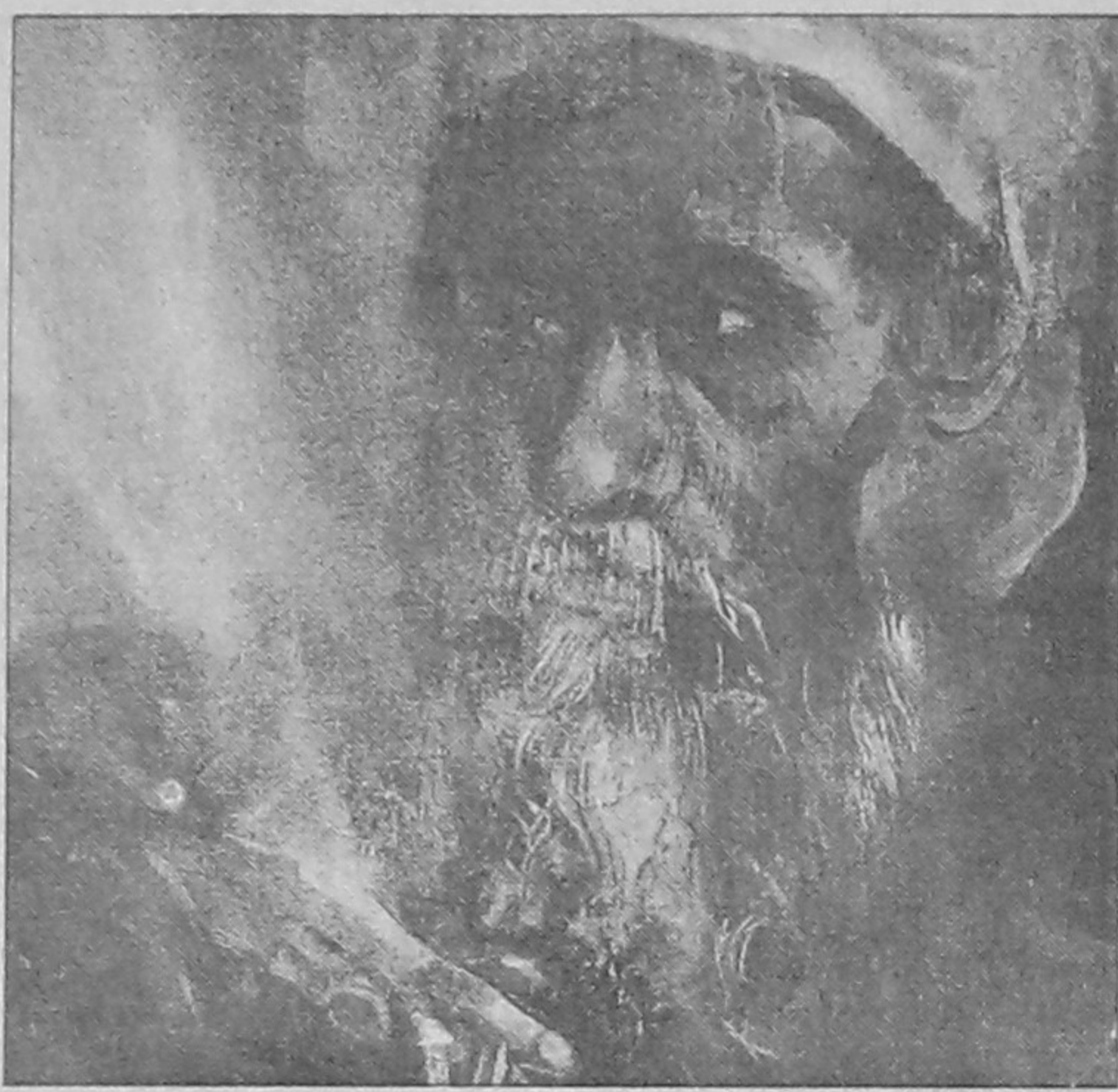
Man behind smoke, Arylic, 2000