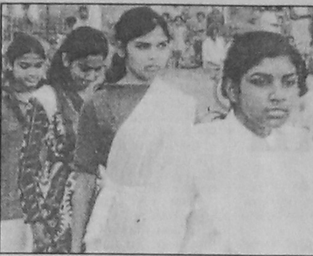
Young women receiving guerrilla training in 1971. (still from the documentary).

None paid a bigger price in our War of Liberation as our women did. And their trauma only began there. They subsequently lost a place in society and suffered, in most cases for the rest of their lives. And the sad truth is that very few people attempt to document their