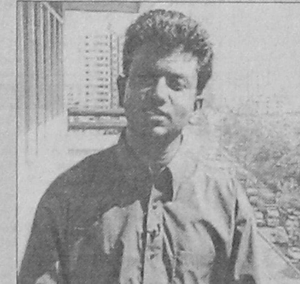
Pratibedan on Ekushey television tonight at 8 and 11:30

Rustom 11:30 Chalti Ka Naam Antakshri 12:30 Family Fortunes 1:00 Musafir Hoon Yaroon 1:30 Mirch Masala 2:00 Hello Cinema 2:30 Mail Milap 2:40 Star Sunday Matinee Yamraaj 6:00 Shrimati Sharma Na Kehi Hai 6:30 Jubilee Plus 7:00 Star Bestsellers- 8:00 Star Film Utsav- Chhito Bahu Rajehs Khanna, Sharmila Tagore 11:30 Jubilee Plus 12:00 Janata Ki Adalat 12:30 Shrimati Sharma Na Kehi Hai 1:00 Hasna Matt 1:30 Chalti Ka Naam Antakshri 2:30 Jubilee Plus 3:00 Kucha Papad pucca Papad 3:30 Kahani Ghar Ghar Ki 4:00 Kabhi Kabhi Mere Ghar Mein Buchaal