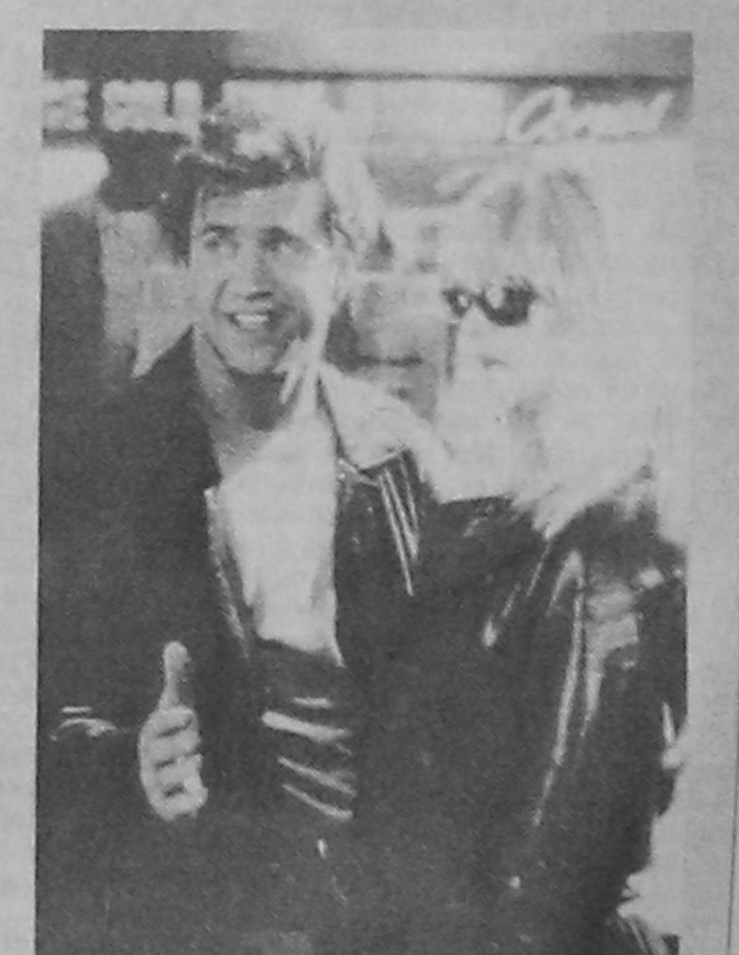
Bird On A Wire tonight on HBO at 10.

This action-romantic comedy stars Mel Gibson and Academy Award-winning actress Goldie Hawn as a couple thrown together in less-than-ideal circumstances. He is Rick Jarmin, her college boyfriend whom she assumed dead. When he shows up alive and kicking, she wishes he were dead. That is, until she finds out, a lot of other people want him that way too. Seems he turned state's witness against a bunch of very ugly people and has since been hiding under the Federal Witness Protection Program. He has been successfully living under one identity after another, but now has to confront his past when she blows his cover. Director John Badham, skillfully orchestrates the chases, the explosions and the death-defying stunts that culminate in a spectacular zoo set one of the largest studio sets to be built in Vancouver. In addition to running from the bad guys, Gibson and Hawn have to contend with six tigers, a lioness, three jaguars, a baboon, four alligators and an assortment of colourful four-legged "extras."