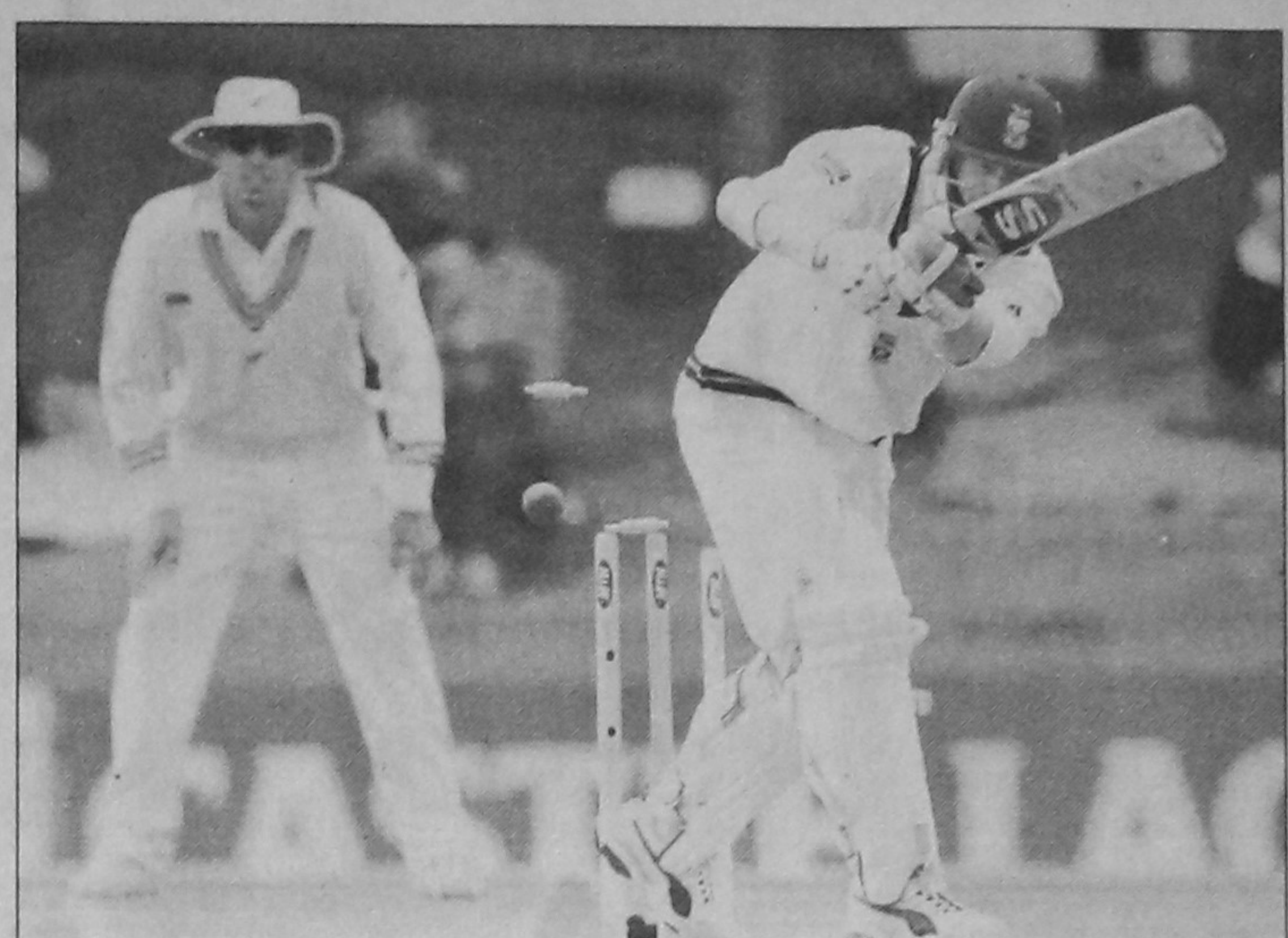
South Africa's Lance Klusener is bowled by Shayne O'Connor of New Zealand on the second day of the first day of the first Test at Bloemfontein yesterday.

On the first set point, Coetzer hit a service return that was so clean that Seles applauded.