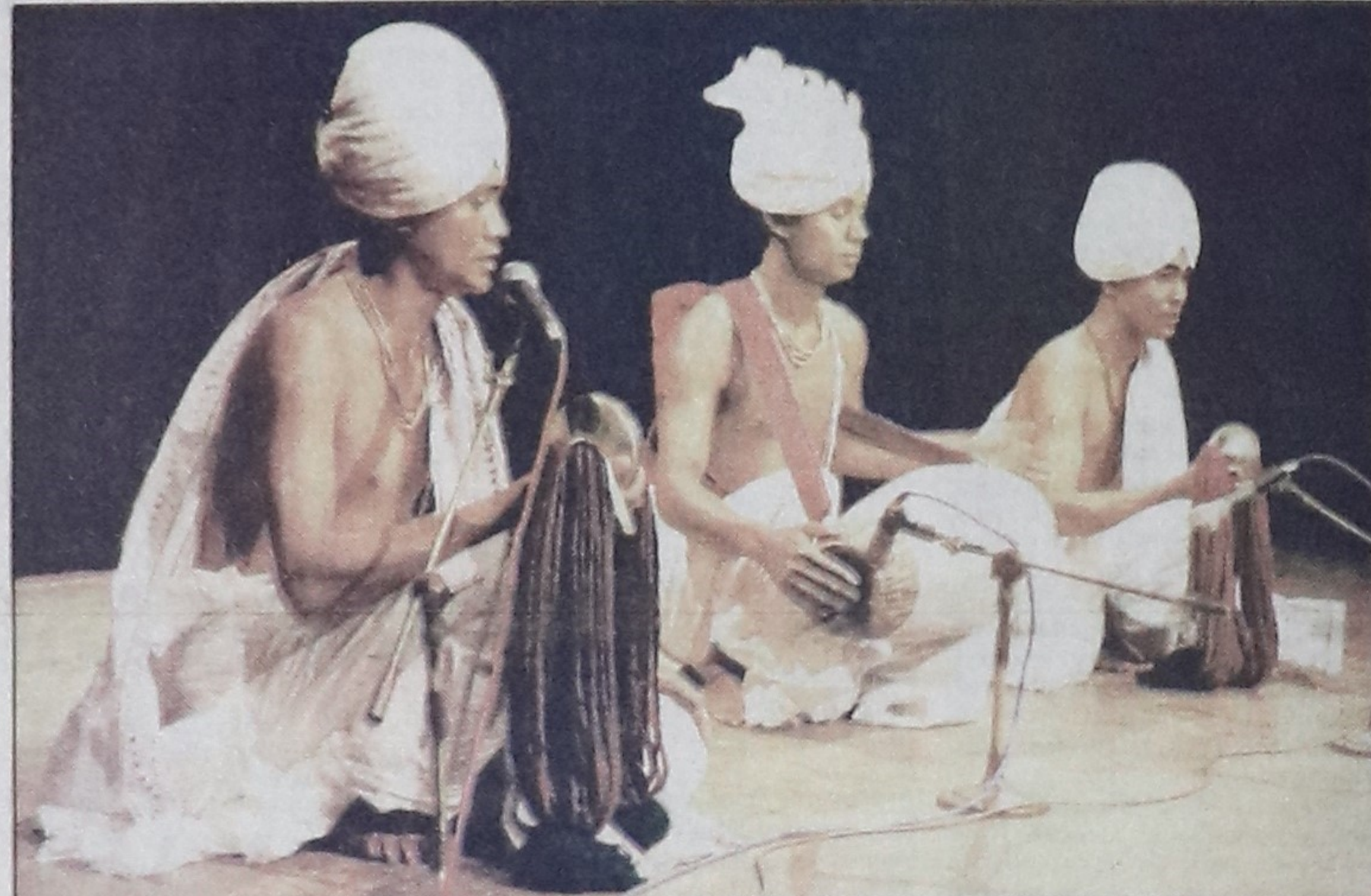
A trio performs a Monipuri classical score at a function yesterday, jointly organised by the Department of Dramatics and Music and Centre for Classical Dance at the Nat Mandal of Dhaka University.

The caller also said they did it to know, how police security is functioning, police sources added.