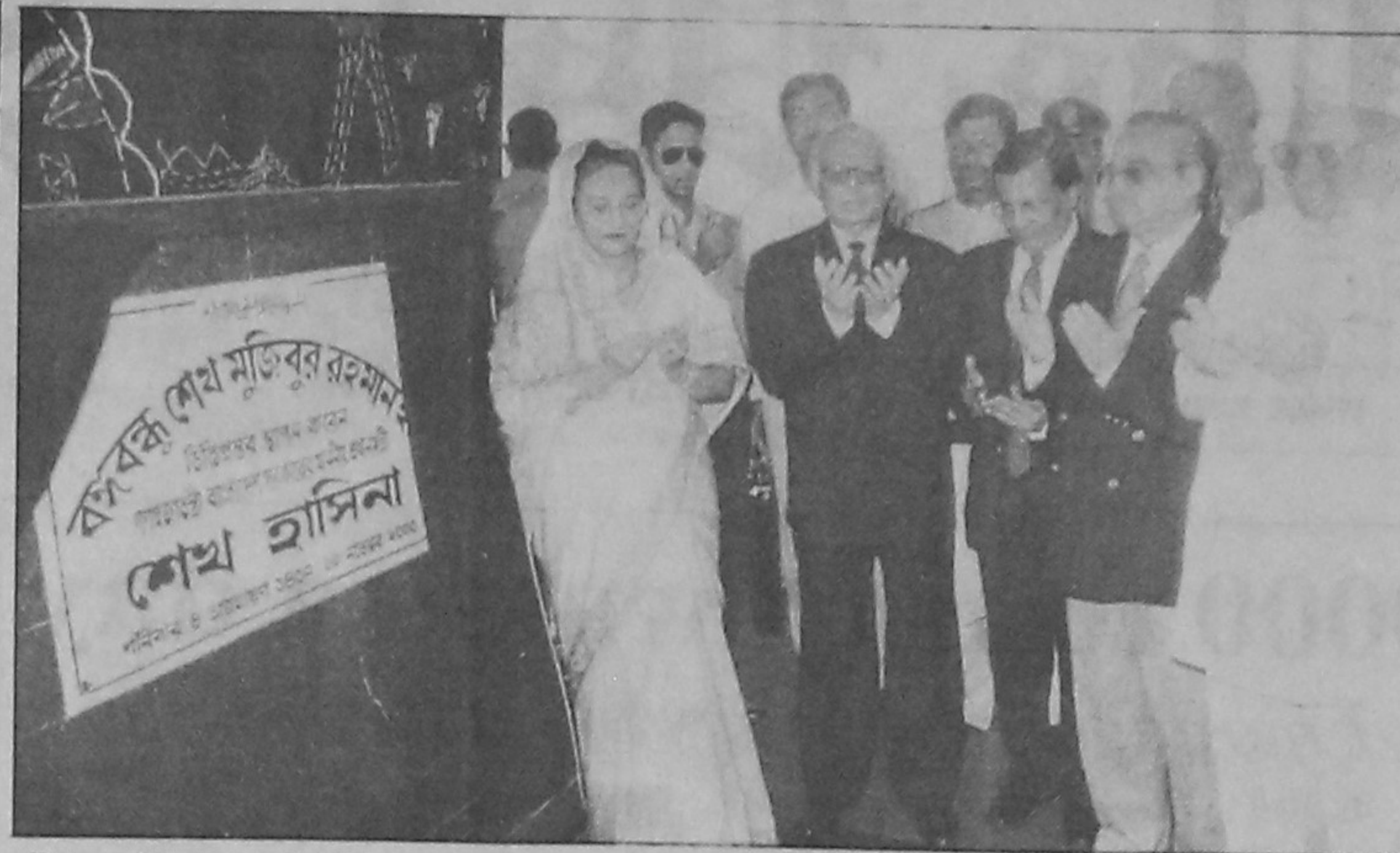
Prime Minister Sheikh Hasina offering munajat after laying the foundation stone of Bangabandhu Sheikh Mujibur Rahman Hall of the Jahangirnagar University at Savar yesterday.