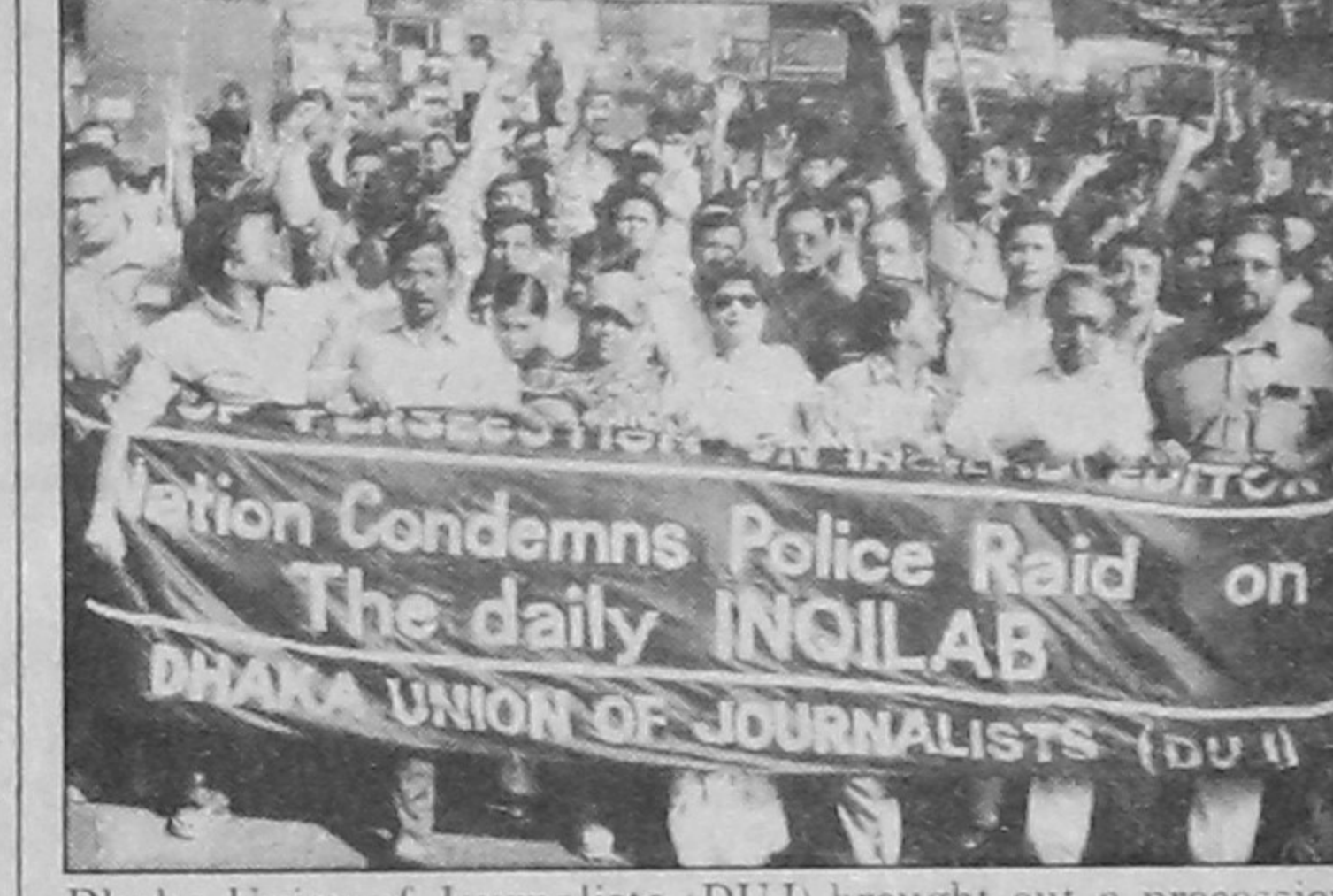
Dhaka Union of Journalists (DUJ) brought out a procession in the city yesterday in protest of police raid on the Daily Inqilab office.

NARAYANGANJ. Nov 16: A local journalist was killed and six people were injured in a tempo-truck collision at Sanarpara area in Siddhirganj thana on Dhaka-Chittagang highway this evening, reports UNB.