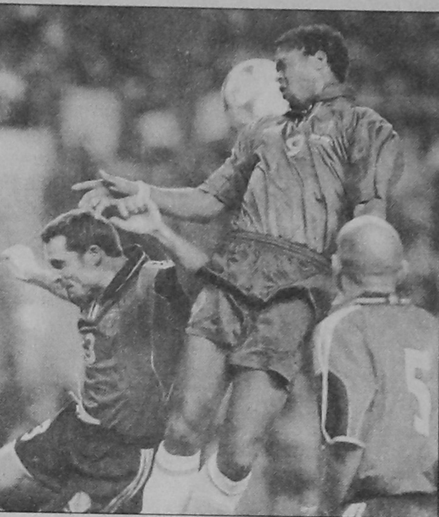
Holland superstar Patrick Kluivert (C) rises above two Spanish players to head during an international friendly at the Olympic Stadium in Seville on November 15.

Frank de Boer was humble after victory, enjoying setting a new national record after beating the 84 caps held by Aaron Winter, admitting "a win for the team is more important than personal glory, although I admit it's been a hard task notching up 85 caps."