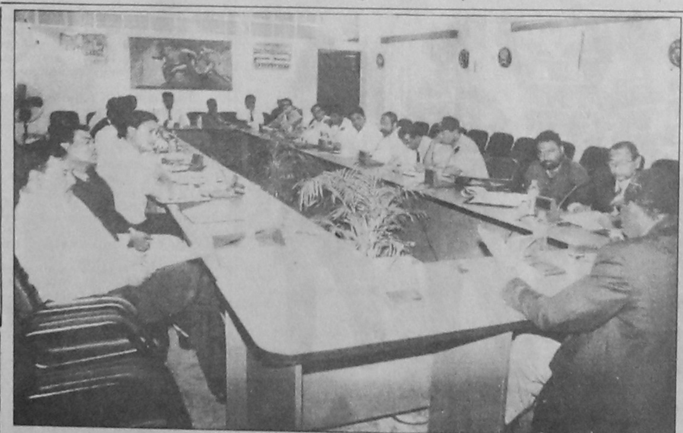
Celebrated West Indian umpire Steve Bucknor addressing a seminar of local umpires at the National Sports Council auditorium yesterday