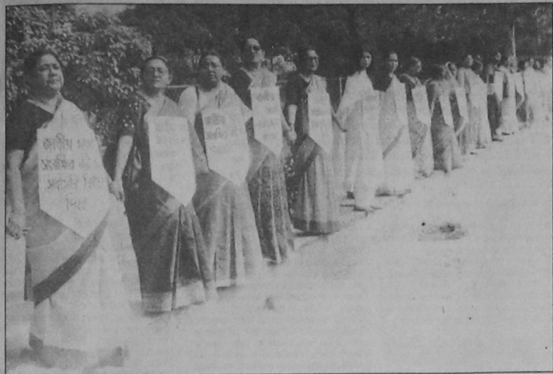
Actions committee for Increase in Number and Direct Election to Reserved Seats for Women in the Parliament organised a human chain in the city yesterday.