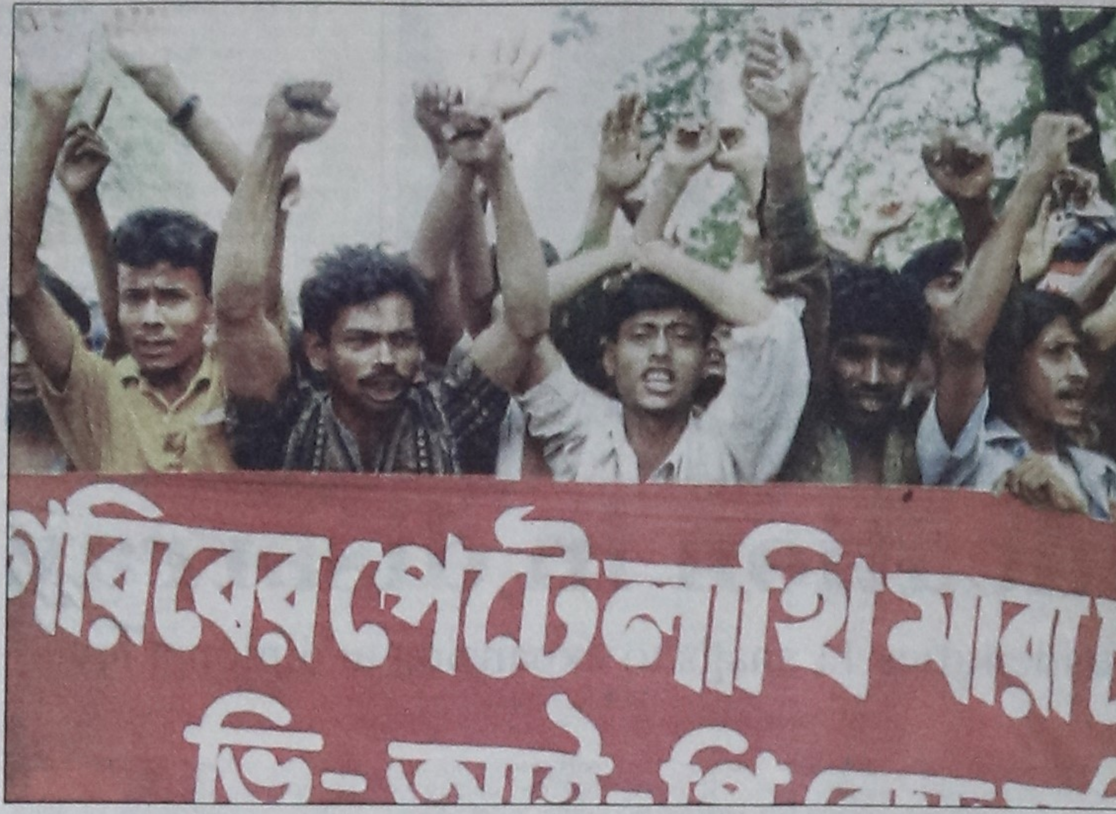
Rickshawpullers took to streets in the city yesterday protesting a government decision to ban rickshaws on Mirpur road.