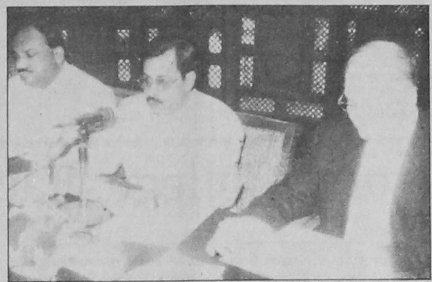
Health and Family Welfare Minister Sheikh Fazlul Karim Selim addressing a press conference marking the formal announcement of the National Health Policy at Sheraton Hotel yesterday.