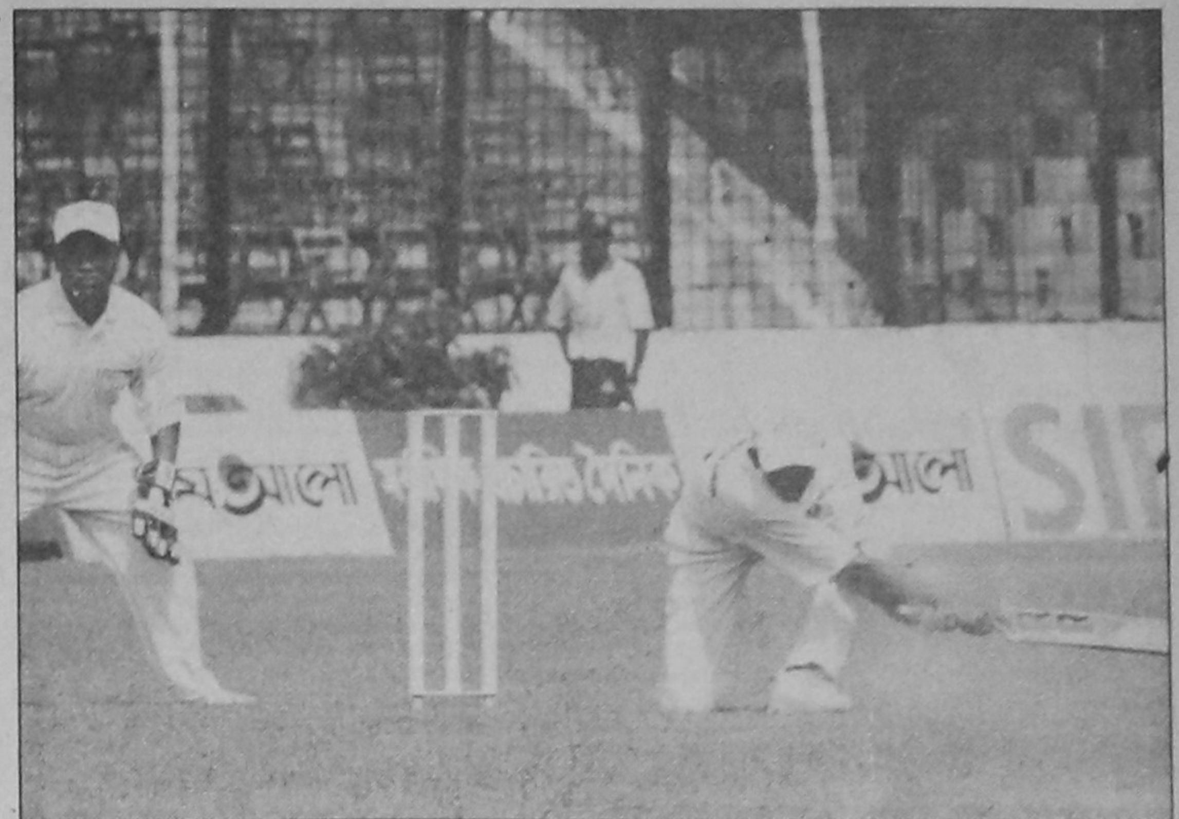
A blind cricketer plays a sweep shot during an exhibition game at the Bangabandhu National Stadium during the lunch break yesterday.