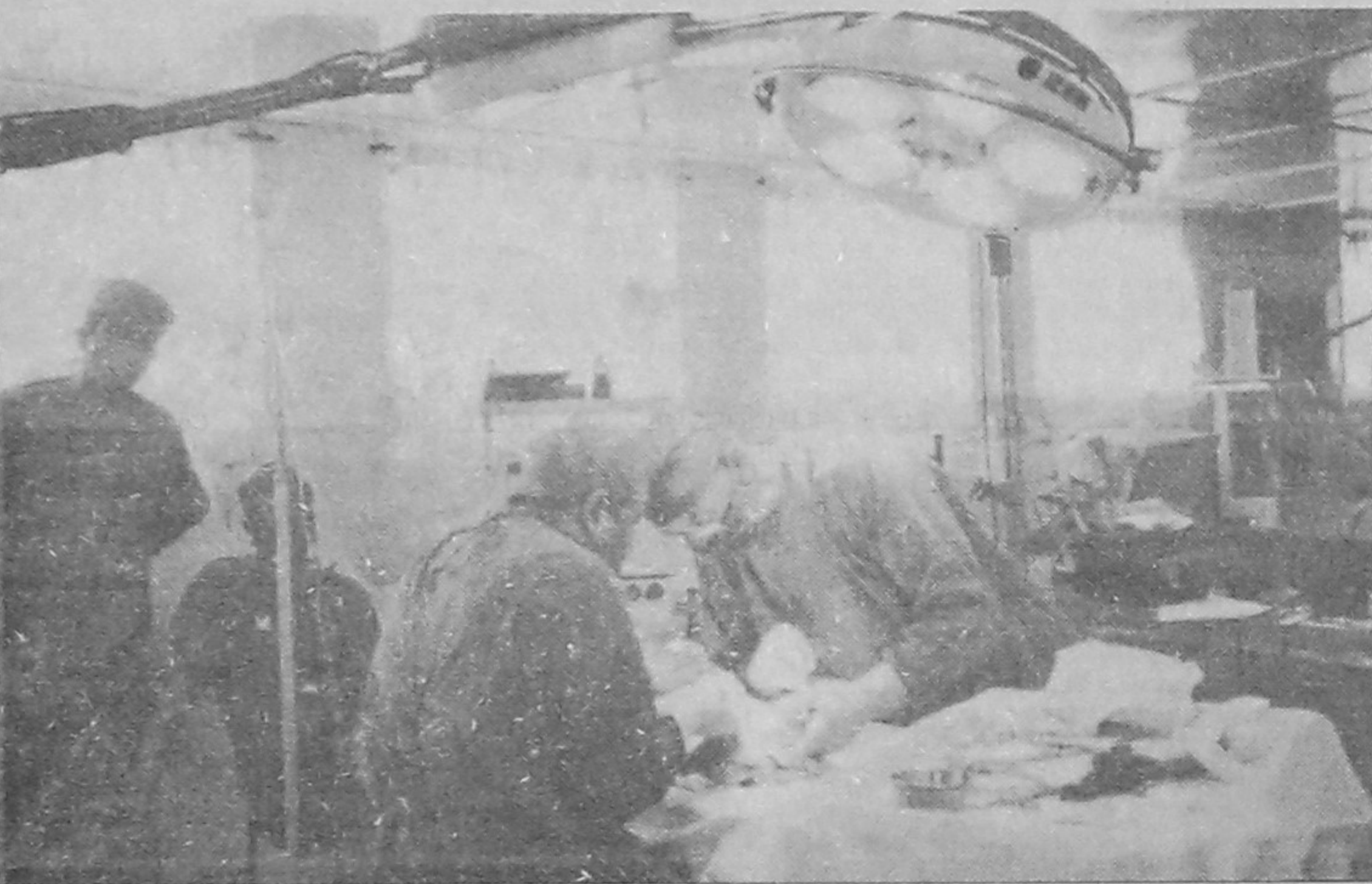
A child is being operated upon on board -Jibon Tori.