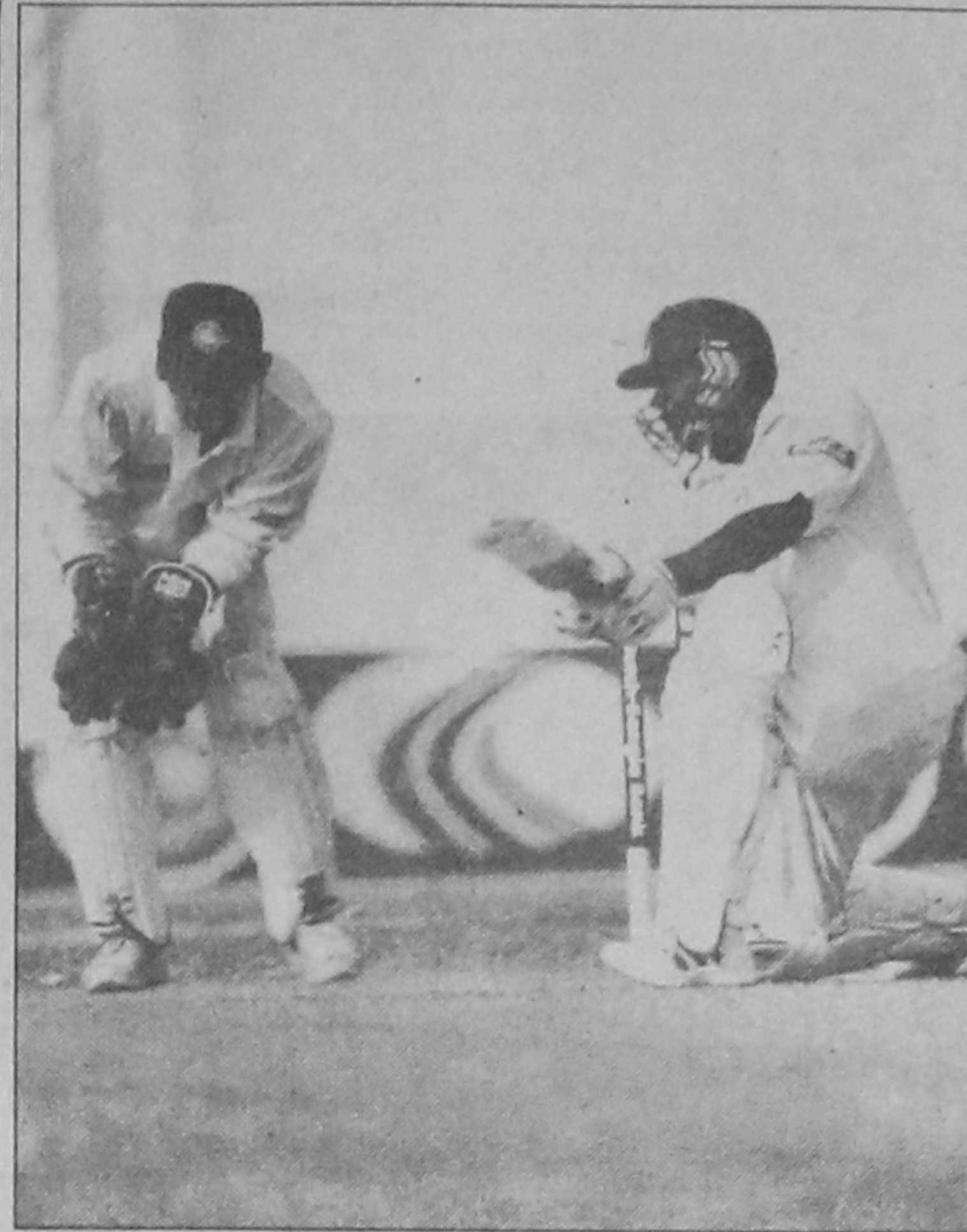
STARS OF THE DAY: A combo picture shows Aminul Islam (L) executing a square-drive while Habibul Bashar sweeps Murali Kartik on way to their half centuries on the first day of the Inaugural Test at the Bangabandhu National Stadium yesterday.

CHAPPELL'S MISTAKE According to veteran television commentator Ian Chappell knows Prime Minister Sheikh Hasina as the president of Bangladesh. The former Australian captain and WorTel commentator erroneously referred to her as Bangladesh's head of government twice during the inaugural ceremony of the historic Test match yesterday morning. Many viewers, watching the telecast, thought the gentleman ought to have facts straight on the matter before commenting.