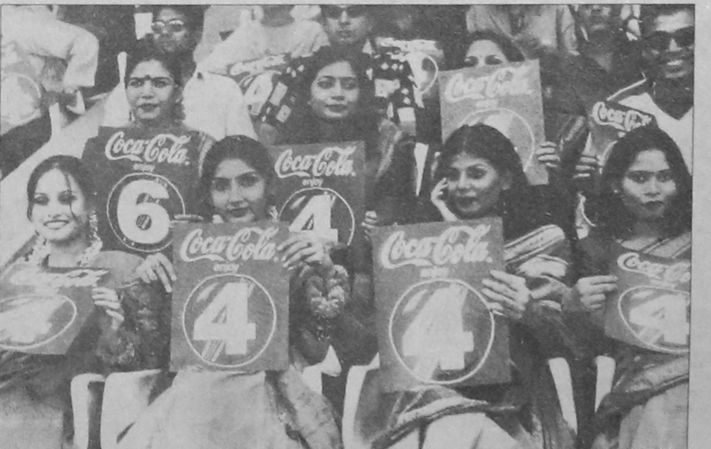
THEY WANT ONLY BOUNDARIES: A few female spectators enjoying the first day's proceedings at the Bangabandhu Stadium