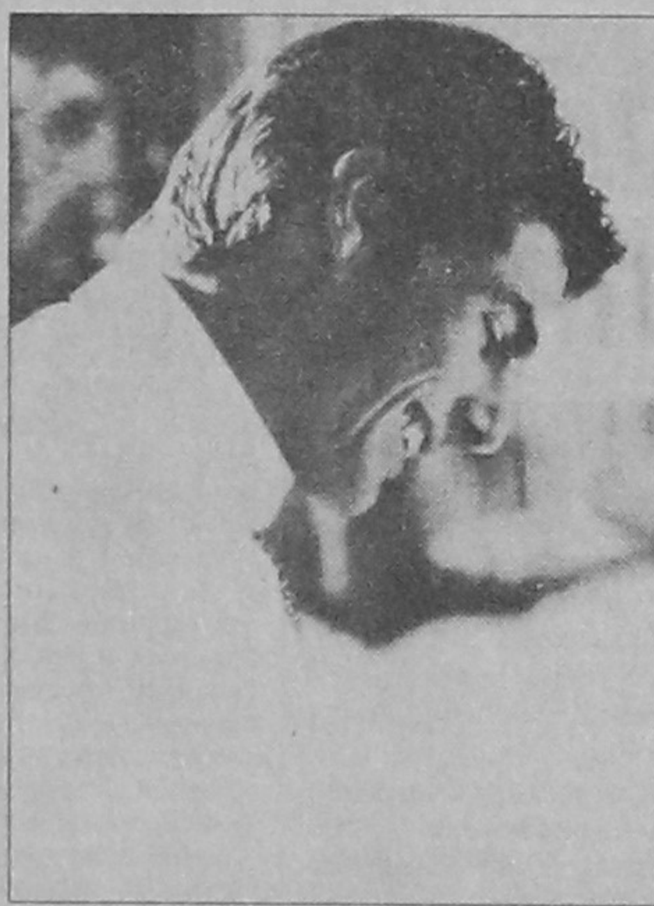
Jerry Maguire Tonight on HBO at 22:00

International sensation Tom Cruise is back in one of his best roles ever. He is the titular Jerry Maguire, a successful sports agent with a high powered agency. When he develops an honorable streak, not only is he fired but he also loses most of his clients and his fiancée in the bargain. He's left with only his least important client - Rod Tidwell (Cuba Gooding Jr.) and the only person who believes in him, single mother Dorothy Boyd (Renee Zellweger). The down and out Jerry must start his life from scratch. This charming comedy/drama features one of the most memo- rable lines in the history of cinema - "show me the money" - delivered with aplomb by Gooding Jr. His efforts won him a Supporting Actor Oscar, for his heart-warming and honest performance. Cruise won a Best Actor nomination.