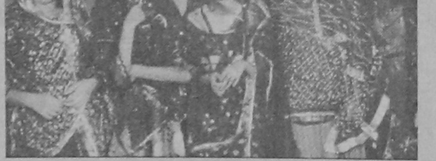
Punnya E Ranani a special programme on Shab E Barat will be aired on Channel i at 6:10p.m.

BBC WORLD 6:00 BBC World News 6:30 World Business Report 7:00 BBC News 7:30 Asia Today / World Business Report 8:00 BBC News 8:30 Asia Today / World Business Report 9:00 BBC World News 9:30 Asia Today 9:45 World Business Report 10:00 BBC News 10:30 Hardtalk 11:00 World News 11:30 World Living: Talking Movies (Pres- Tom Brook) 12:00 World News 12:30 World Living: Question Time India 1:30 BBC World News 1:30 World Focus: Click Online 2:00 BBC World News 2:10 Weekend World: Inside Dot Com: Tales of The Electronic Goldrush #1/4- We Need Money 7:00 BBC World News 7:10 World Living: The Entertainment Biz #5/6- Late Night Talk 8:00 BBC News 8:30 Weekend World: Click