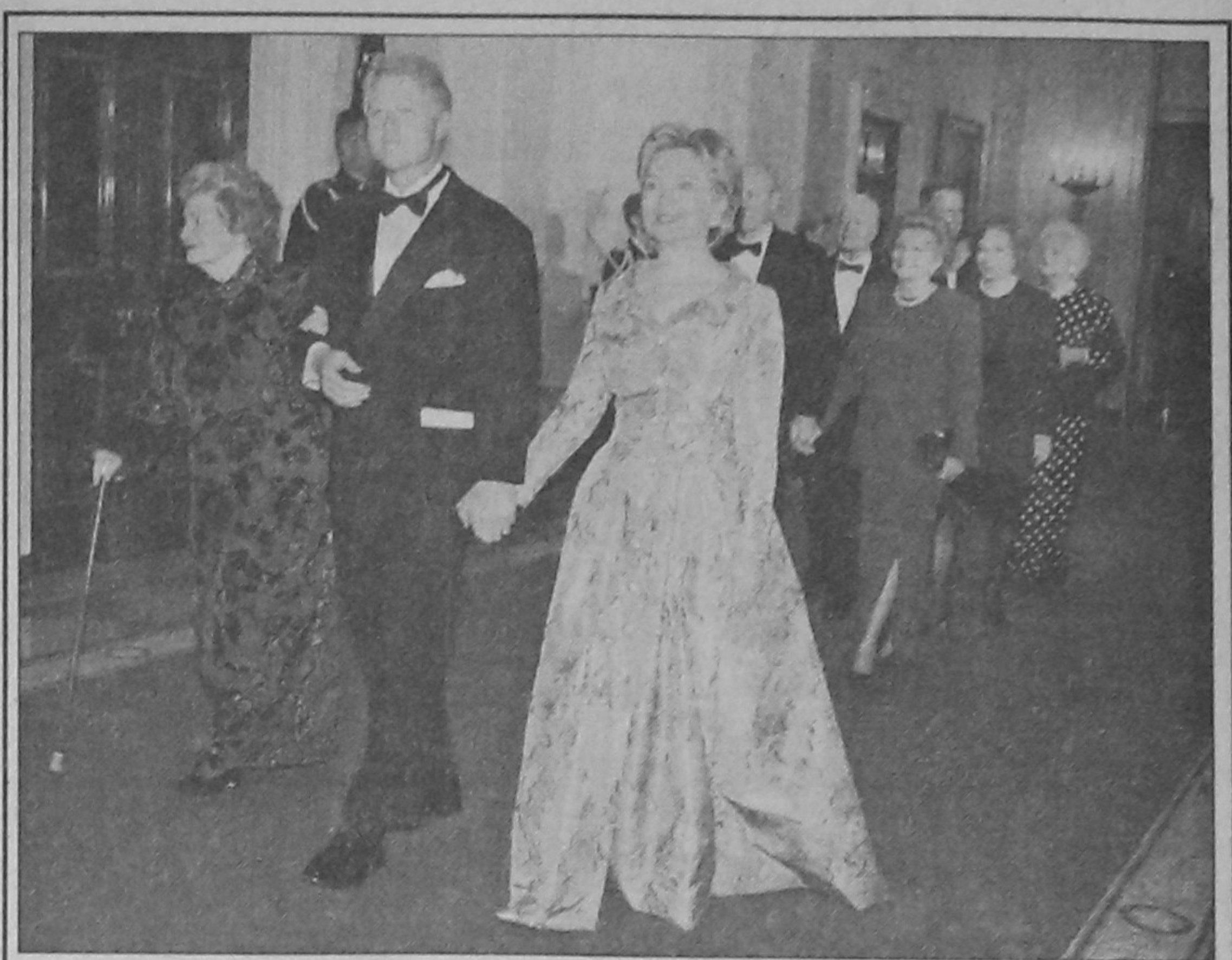
Former US First Lady Byrd Johnson; US President Bill Clinton, First Lady and Senator-elect Hillary Rodham Clinton, former President Gerald Ford, his wife Betty Ford; former President Jimmy Carter, and his wife Rosalynn Carter; and former President George Bush and his wife Barbara Bush walk into the East Room of the White House on Thursday for the 200th Anniversary White House Dinner.