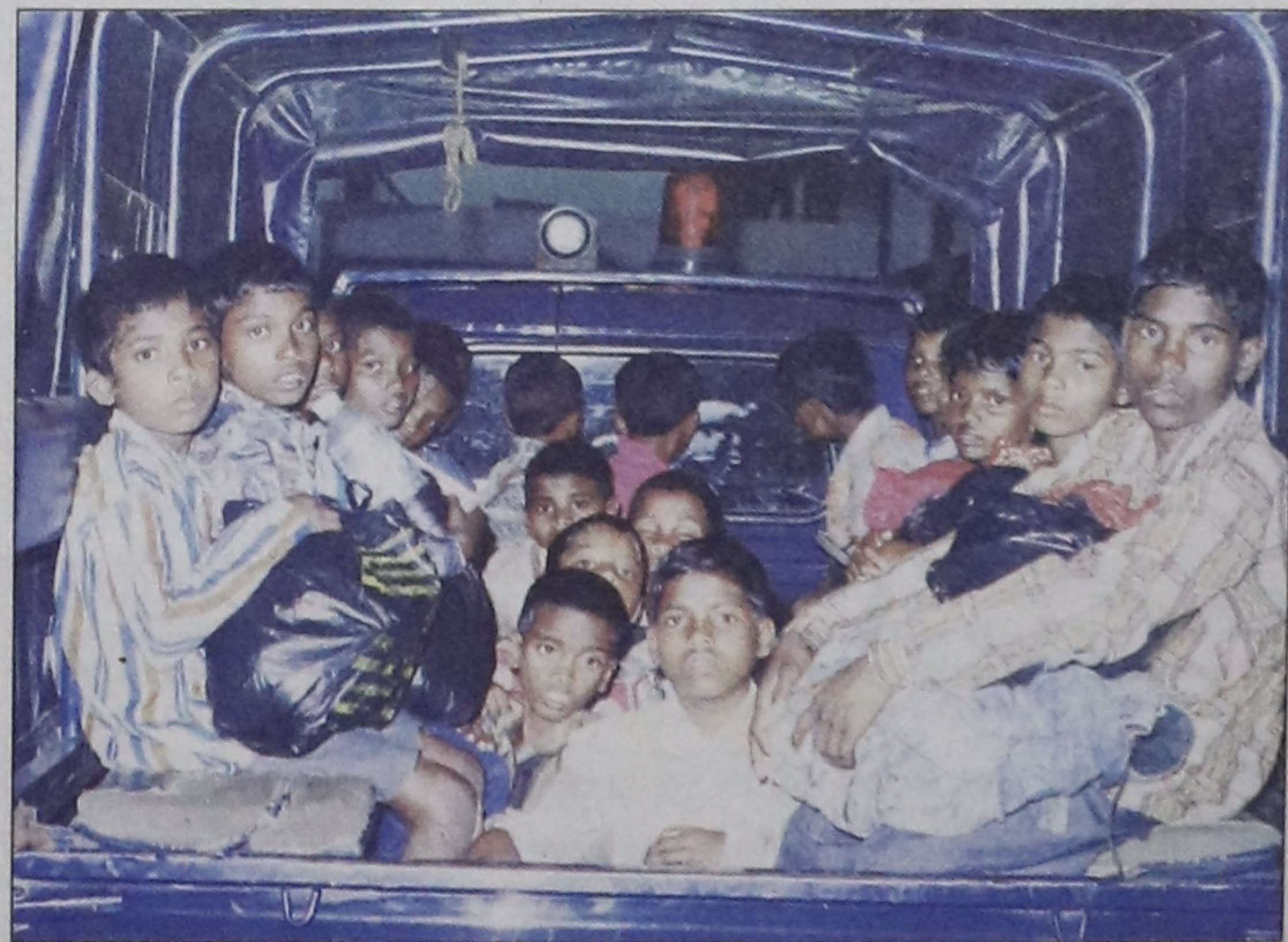
Nineteen children were rescued from a bus counter in the city's Shyamoli area yesterday. They were being boarded on a Ranganmati-bound bus when police intervened. The alleged traffickers, seven of them, were nabbed.

The trouble began at around 1:30 pm when police prevented activists of Jamaat and its student front Shibir from taking out a militant procession from Andarkilla Jame Mosque after Juma prayers. They tried to bring out the procession in support of their earlier announced tafsir mahfil by Jamaat central leader Delwar Hossain Saidi at Parade See page 11 col 4