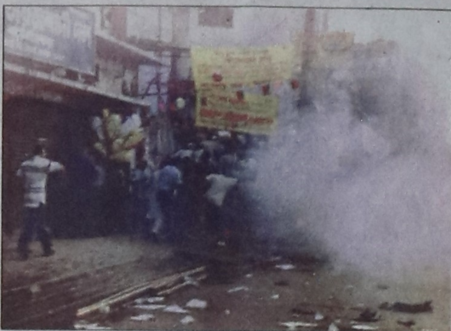
People run for cover after home-made crackers were exploded at the Jatiyatabadi Chhatra Dal's rally in front of BNP central office at Naya Paltan yesterday.