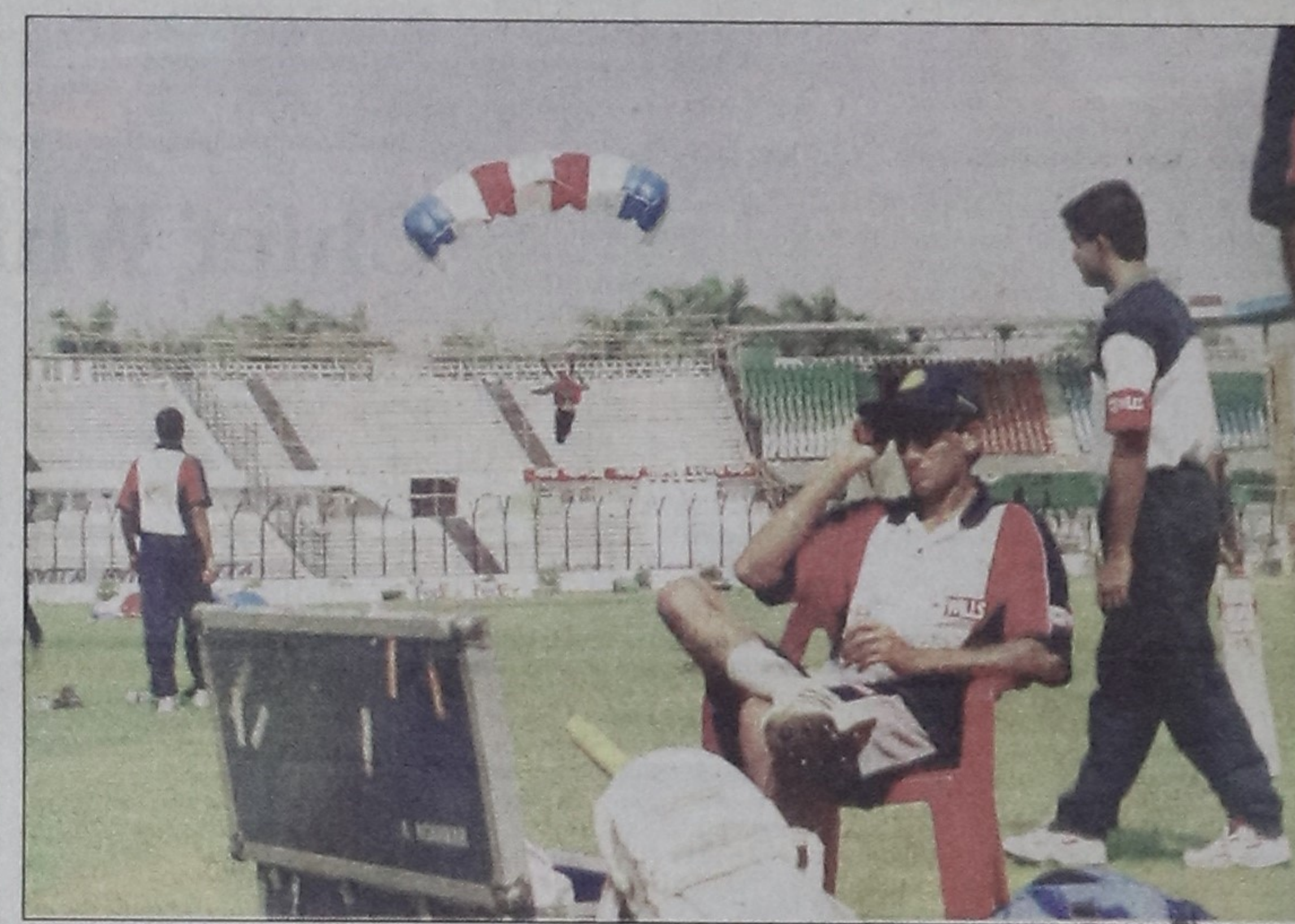
Indian captain Saurav Ganguly (extreme right) watches an army paratrooper make a landing at Bangabandhu National Stadium during a practice session yesterday. Eleven army paratroopers carrying flags of 10 Test-playing countries and the Bangladesh Cricket Board will land at BNS at lunch break during the second day of Bangladesh's maiden Test match against India to celebrate yet another milestone in the country's sporting history.