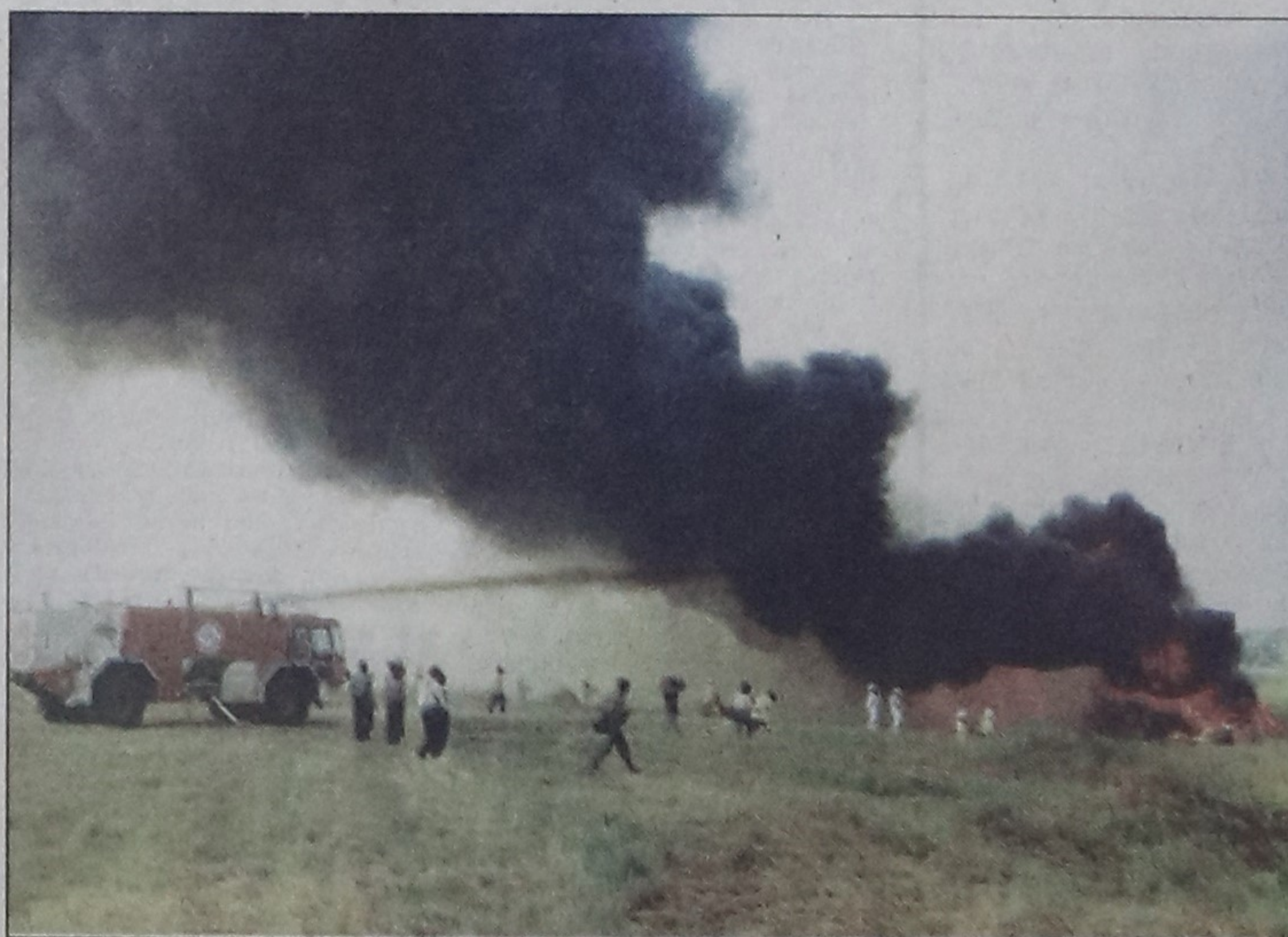
Mock fire at ZIA

The Civil Aviation Authority Of Bangladesh (CAAB) held a fire drill at Zia International Airport yesterday. A dummy Boeing-707 was set on fire while landing in the airport. The two-yearly exercise involved personnel from Civil Aviation Fire Services, Fire Service and Civil Defence.