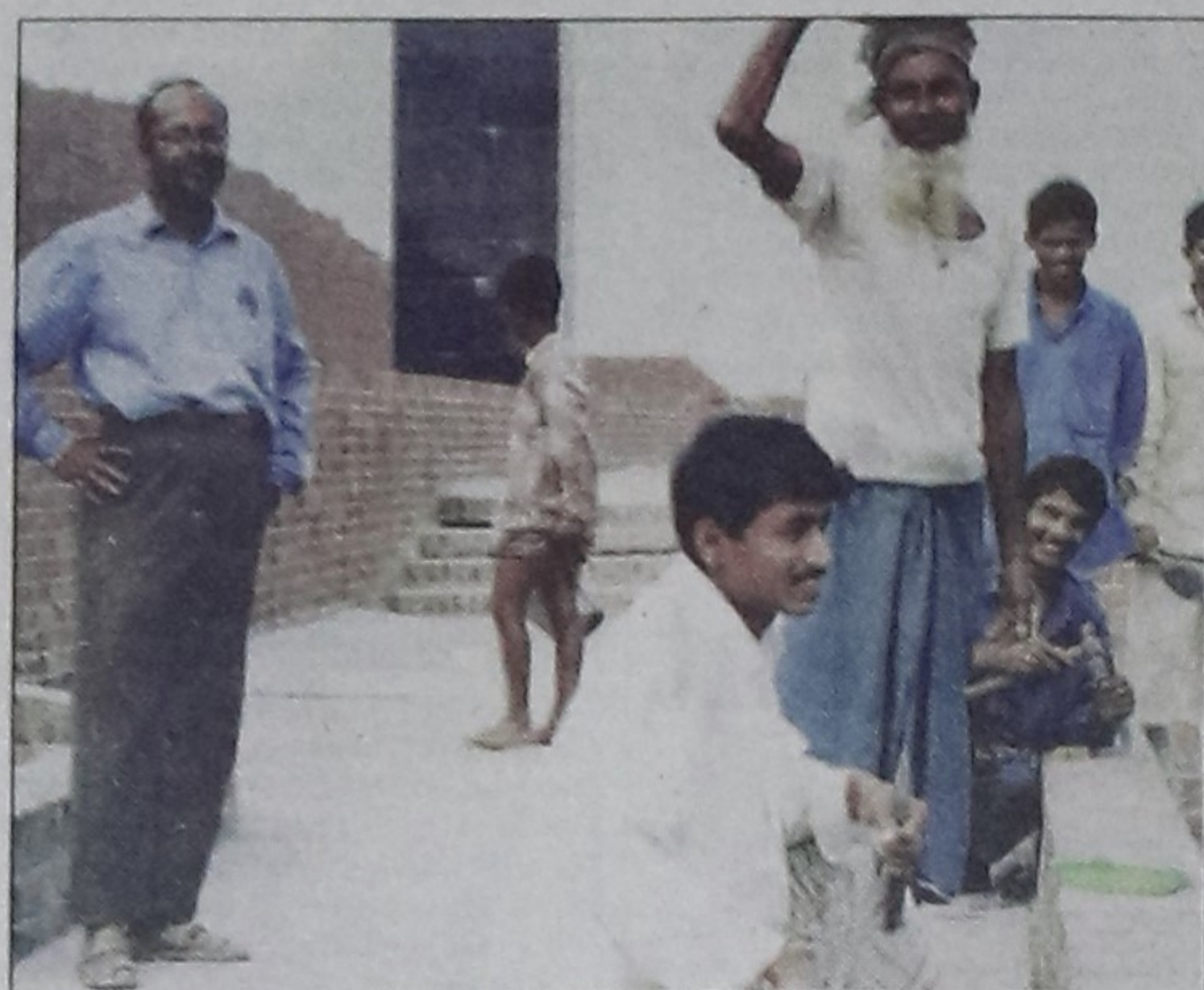
Cracks in the memorial

"It was done in a hurry and they are now paying the price for