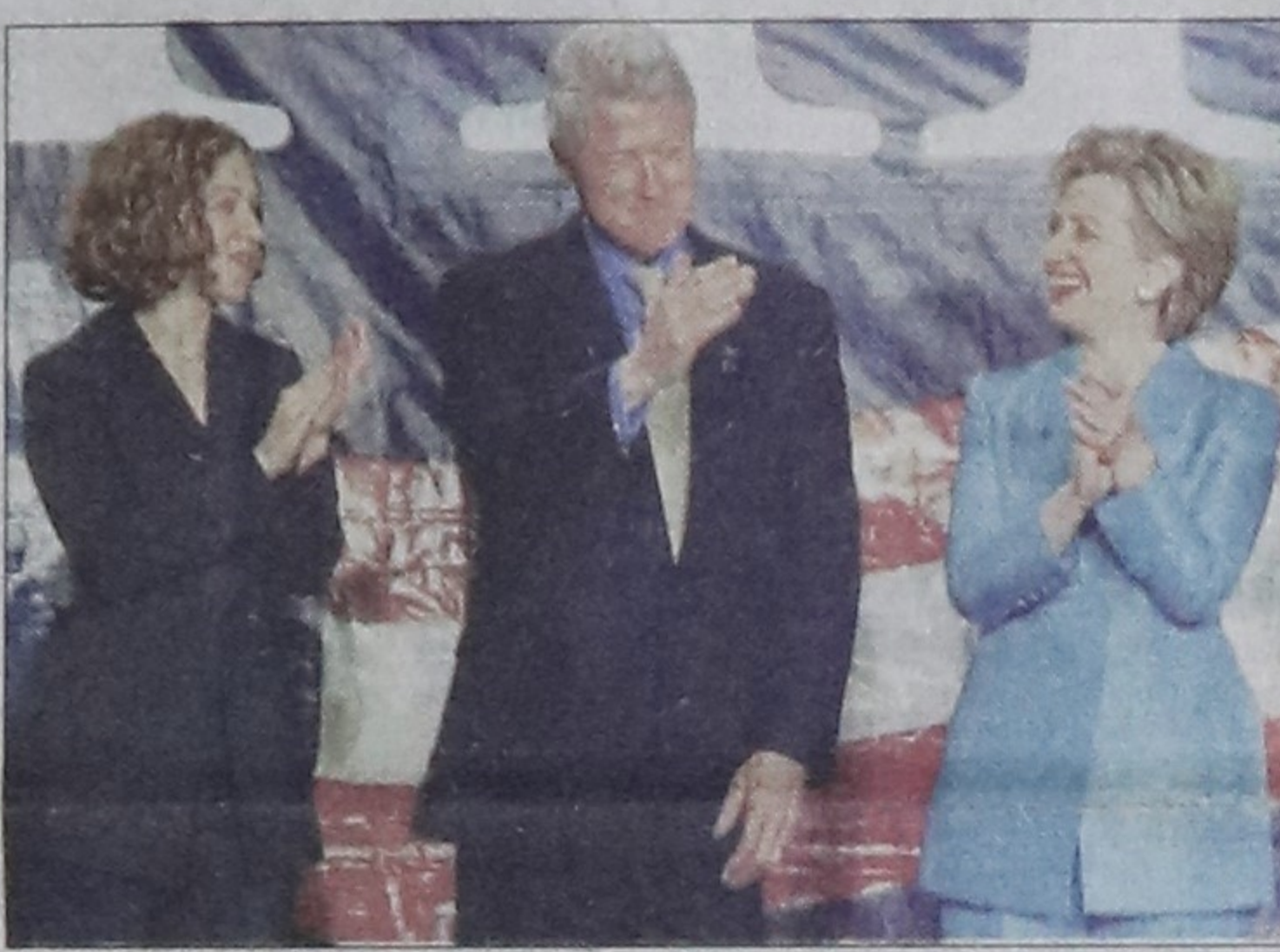
US First Lady Hillary Rodham Clinton (R) and Chelsea Clinton (L) stand with US President Bill Clinton (C) as he salutes the crowd at Hillary's victory party on Tuesday at the Grand Hyatt in New York City.