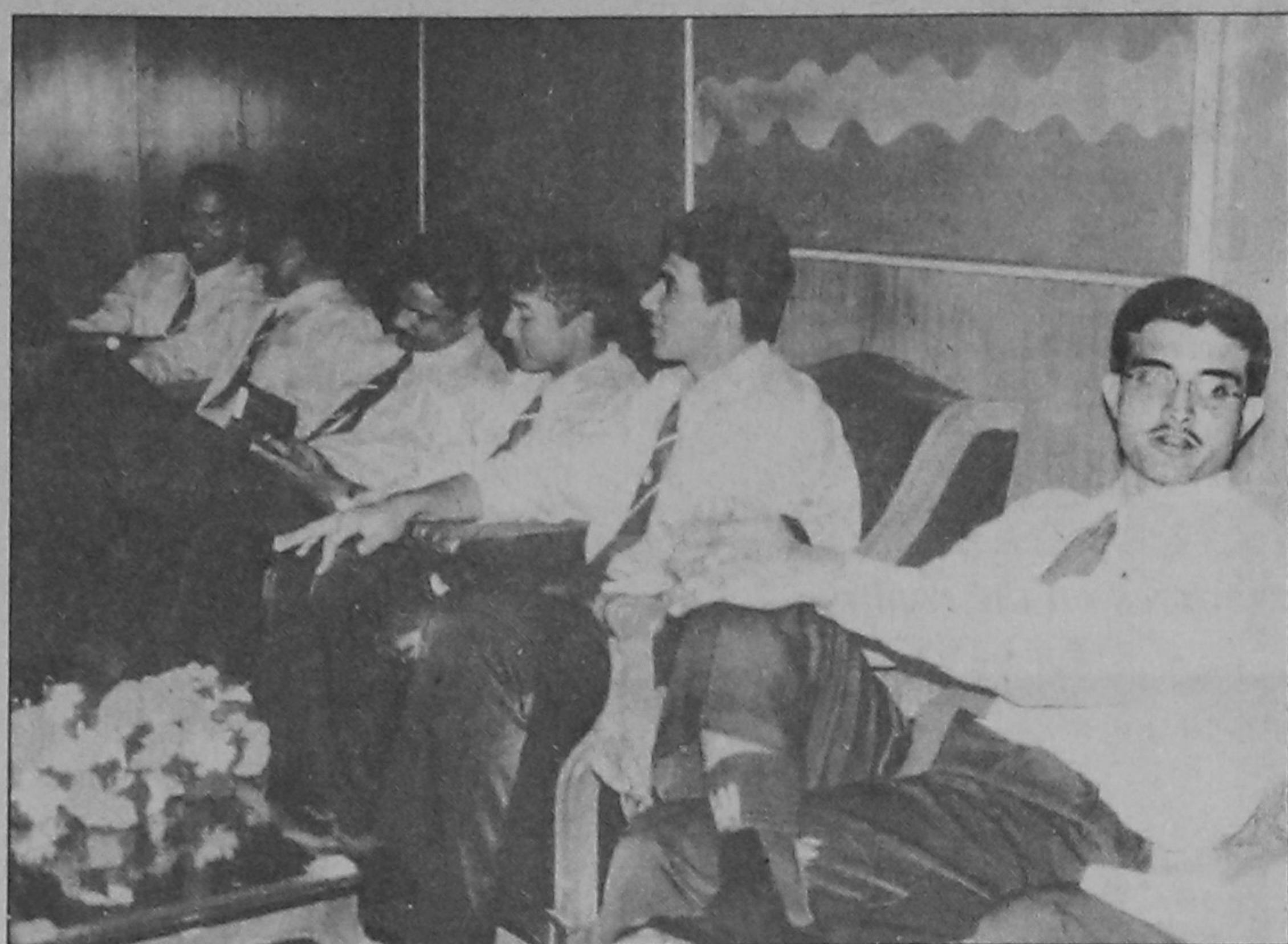
Indian cricketers, including the new pace sensation Zaheer Khan (2nd from R), waiting at the VIP Lounge of Zia International Airport on their arrival yesterday.