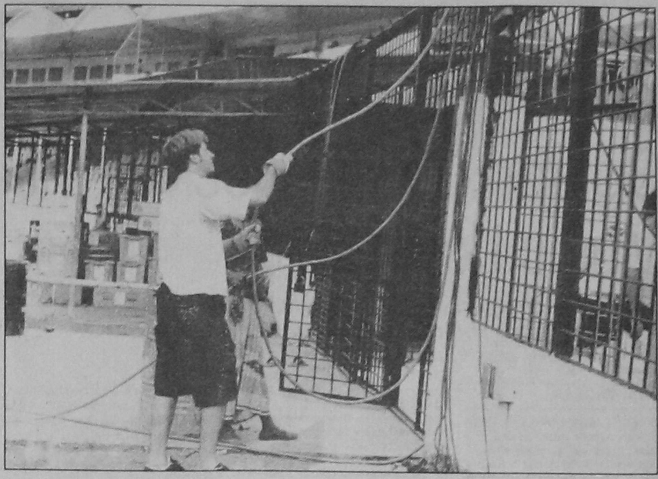
A WorldTel crew member checking an extension cable at the Bangabandhu National Stadium yesterday.

However, Brazilian outfit Corinthians, who won last year's inaugural World Club Championship, will not defend their title in the tournament.