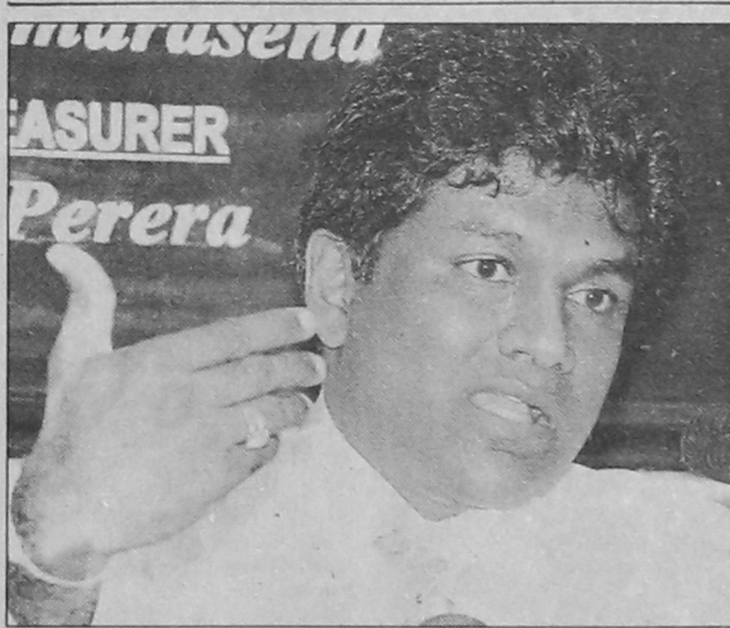
Sri Lanka's cricket chief Thilanga Sumathipala addressing a press conference in Colombo on November 6.