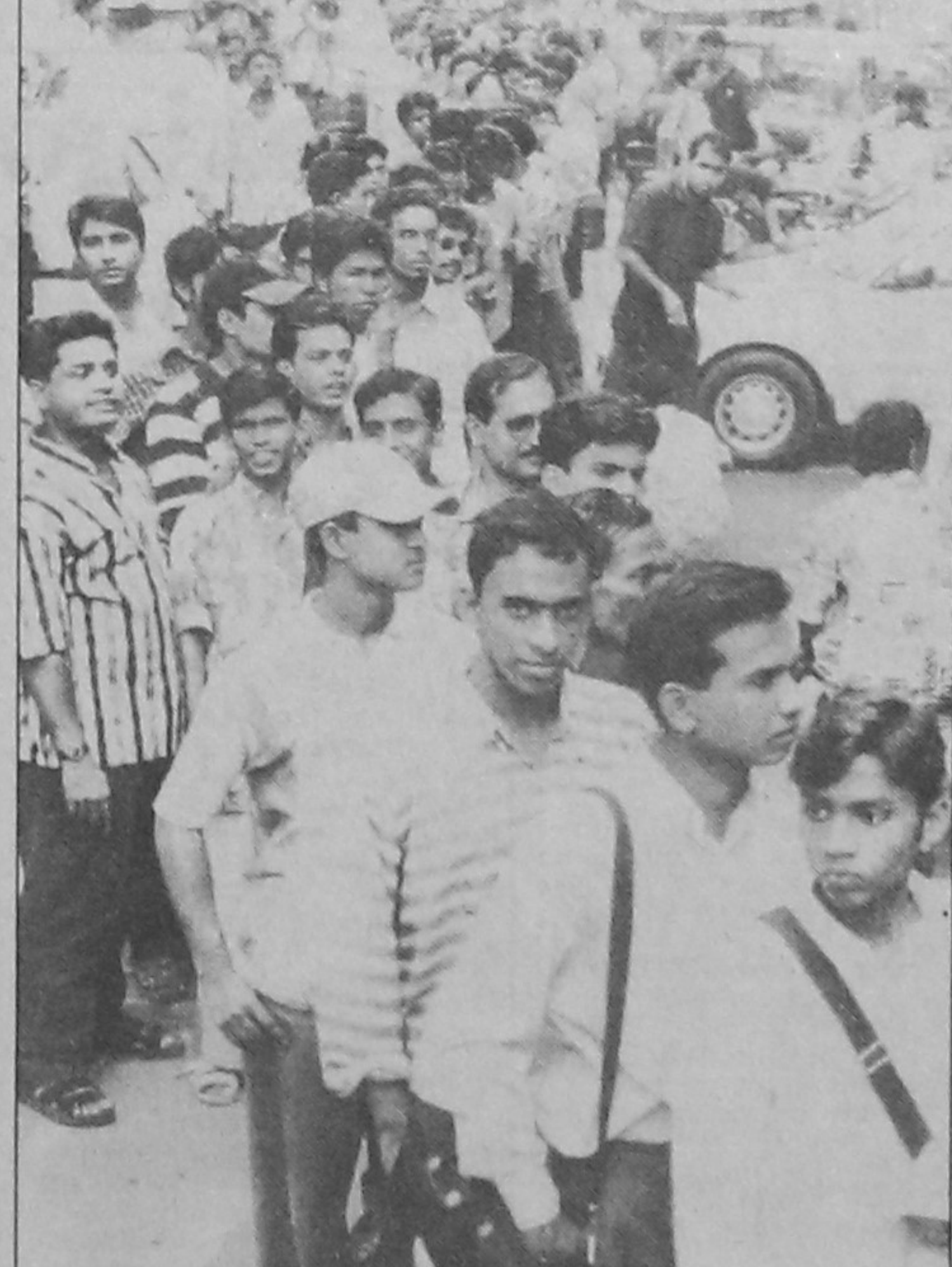
Cricket enthusiasts queue up for tickets of the historic Bangladesh-India Test match in front of the city's Dilkusha branch of Al Baraka Bank yesterday.