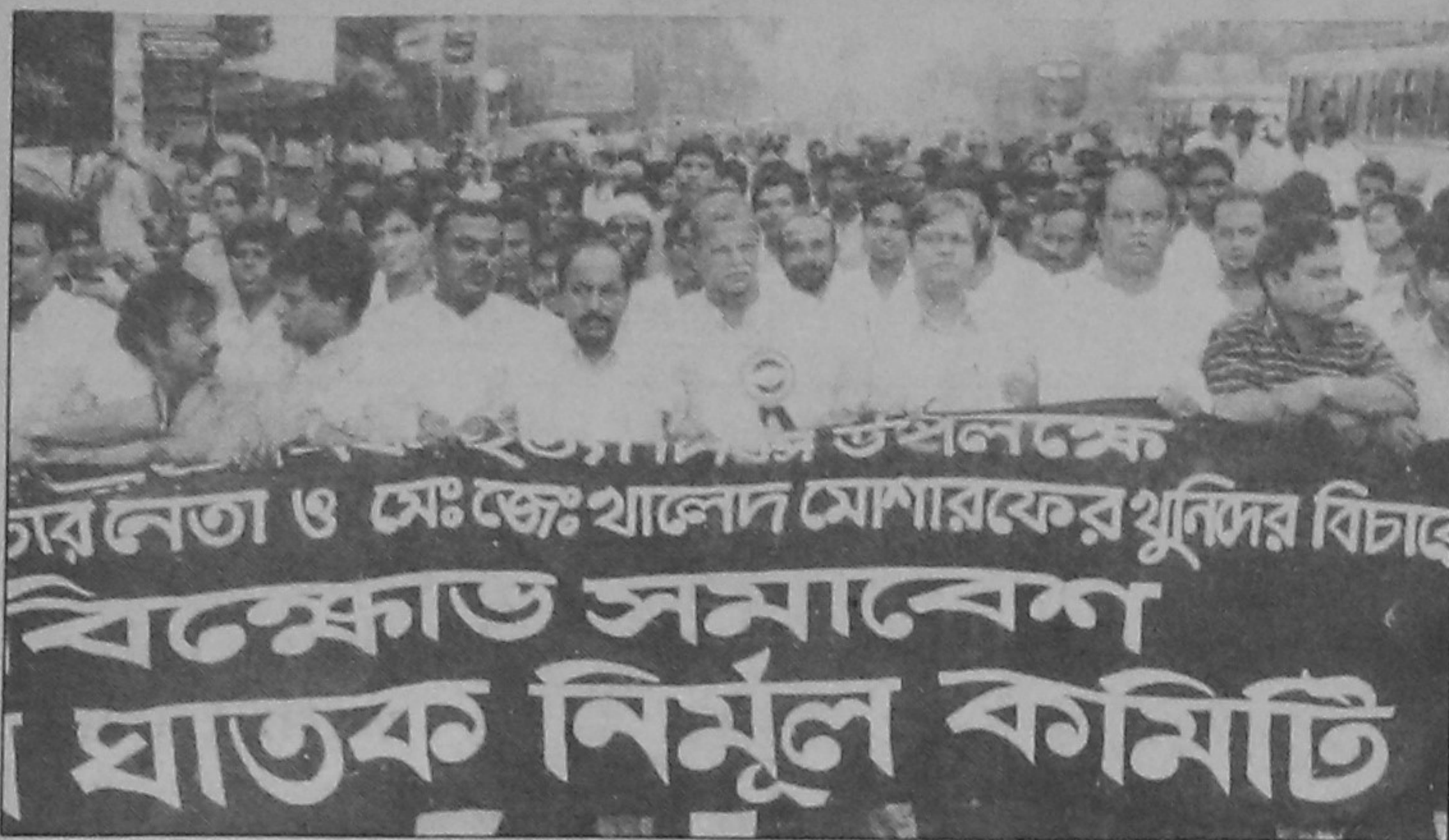
Committee for the Annihilation of the Collaborators and Killers of 1975 paraded the city thoroughfares yesterday demanding trial of the killers of the four national leaders and Maj Gen Khaled Mosharraf.