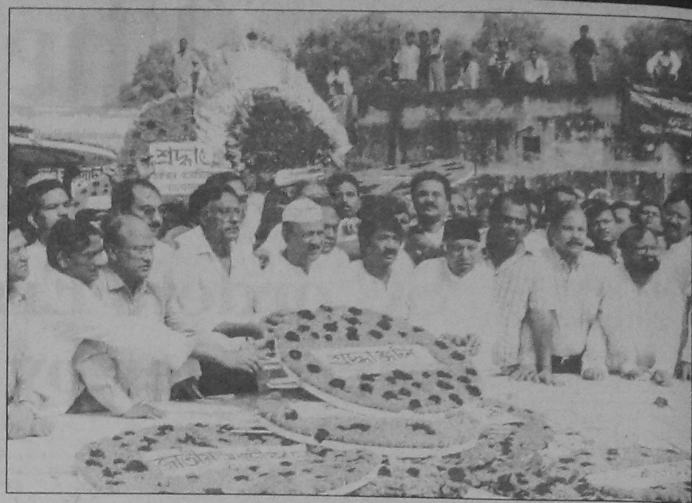
BNP leaders placing wreaths at the mazar of late president Ziaur Rahman on the occasion of 'National Revolution and Solidarity Day' yesterday.

Later, a munajat was offered for the peace of the departed souls of the BTV officials killed following the November 7 incidents.