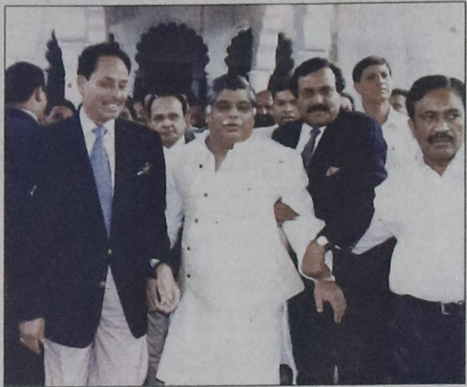
Former President and Chairman of a Jatiya Party faction HM Ershad comes out after the Supreme Court asked him yesterday to surrender before a trial court by November 21.

The Supreme Court yesterday ordered former president H M Ershad to surrender before the trial court by November 21, reports UNB. The order of the Appellate Division with Chief Justice Latifur Rahman in the chair, came following an application of Ershad praying for exempting him to surrender before the trial court.