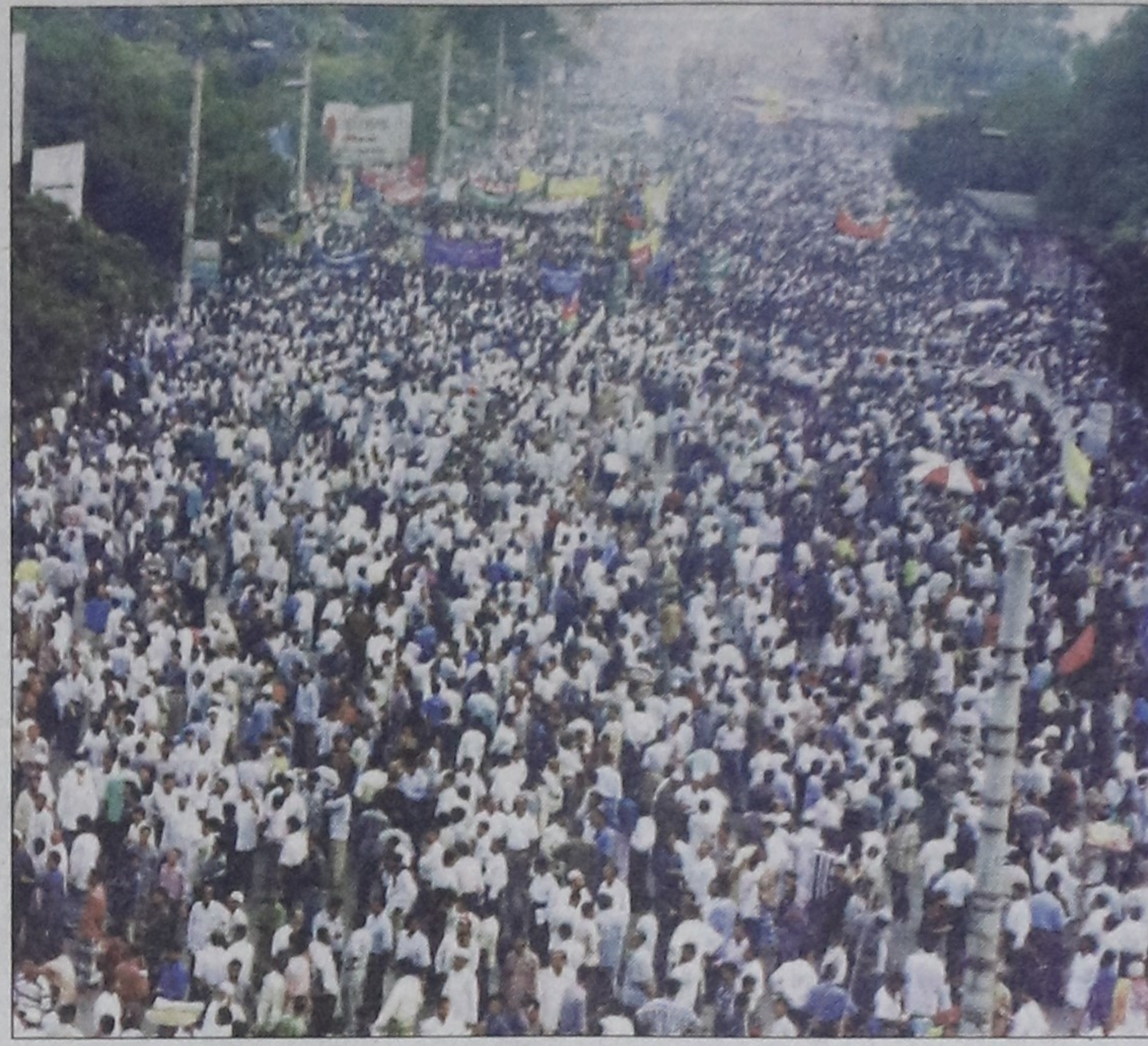
A view of the mass of humanity at the colourful rally the BNP-led opposition alliance staged at Muktangan in the city yesterday on the occasion of "National Revolution and Solidarity Day."

Star Report US oil company Unocal will submit to the government a detailed plan for development of Bibiyana gas field in the first quarter of next year, sources said quoting Unocal officials. The plan will be developed on the basis of government's decision on how it wants to utilise the Bibiyana gas. Unocal officials told Energy Ministry officials yesterday during a presentation on commercial use of the gas. Unocal officials said that the Bibiyana gas field had a probable reserve of 2.48 trillion cubic feet (tcf) of gas. There is a possibility of finding six tcf of gas in the field, they told the ministry officials. The US company proposed some options for utilisation of the gas, which include pipeline export of gas, power generation and conversion of the gas to Liquefied Petroleum Gas (LPG) and Liquefied Natural Gas (LNG) to diversify its use. Unocal strongly argued for pipeline export of gas, saying that it would be possible to extract 500 to 550 million cubic feet of gas per day (mcf) from Bibiyana and export it. At this rate, the total export will be 3.5 tcf in 20 years. See page 11 col 5