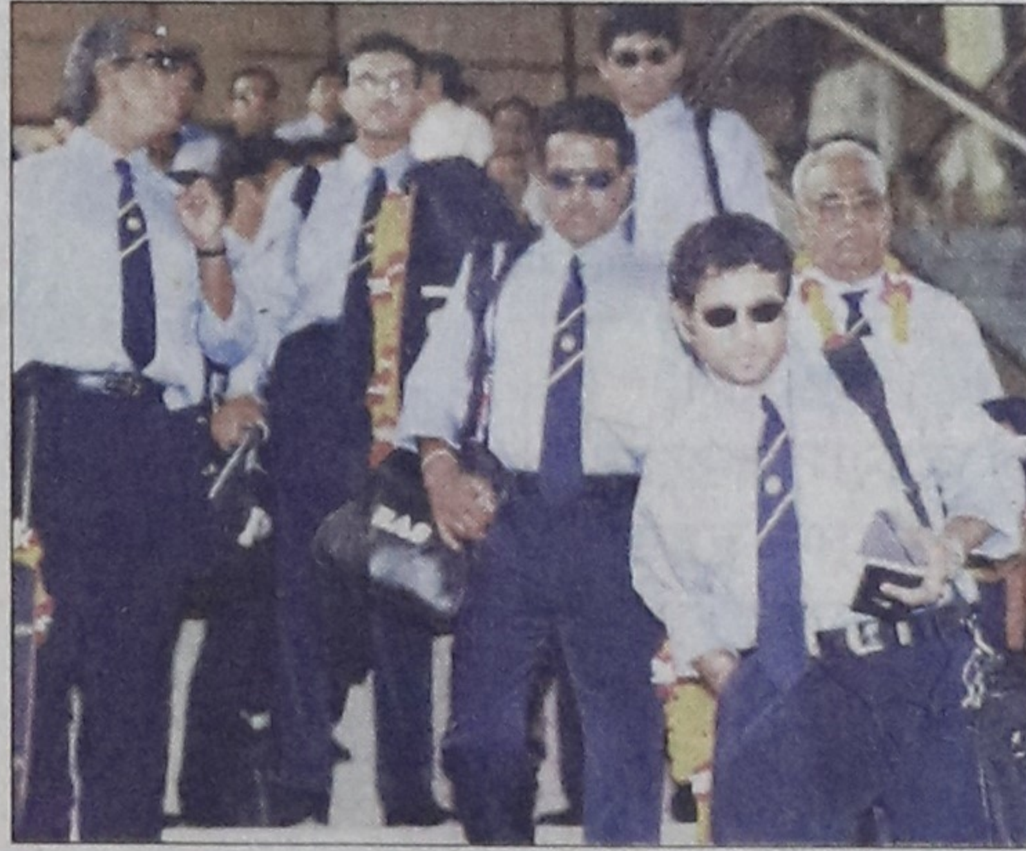
Superstar Sachin Tendulkar leads the pack of Indian cricketers at the arrival lounge of Zia International Airport yesterday. The Indian squad skippered by Saurav Ganguly will play against Bangladesh in the latter's maiden Test match.

By Sports Reporter The Indian cricket team led by Saurav Ganguly arrived in Dhaka yesterday to play their part in the momentous occasion of Bangladesh's baptism in Test cricket. The city however is already in a festive mood ahead of the historic match, which will commence at the Bangabandhu National Stadium on November 10. The Bangladesh Cricket Board (BCB), which has drawn up a five-day programme leading up to the Test, arranged a painting competition and cricket related photo exhibition at the National Sports Council Gymnasium yesterday. There is a grand fireworks display scheduled for today. The explosive gala will be held at Ganasagar Dighi near Rajarbagh Police Lines at 7 pm. See page 11 col 1