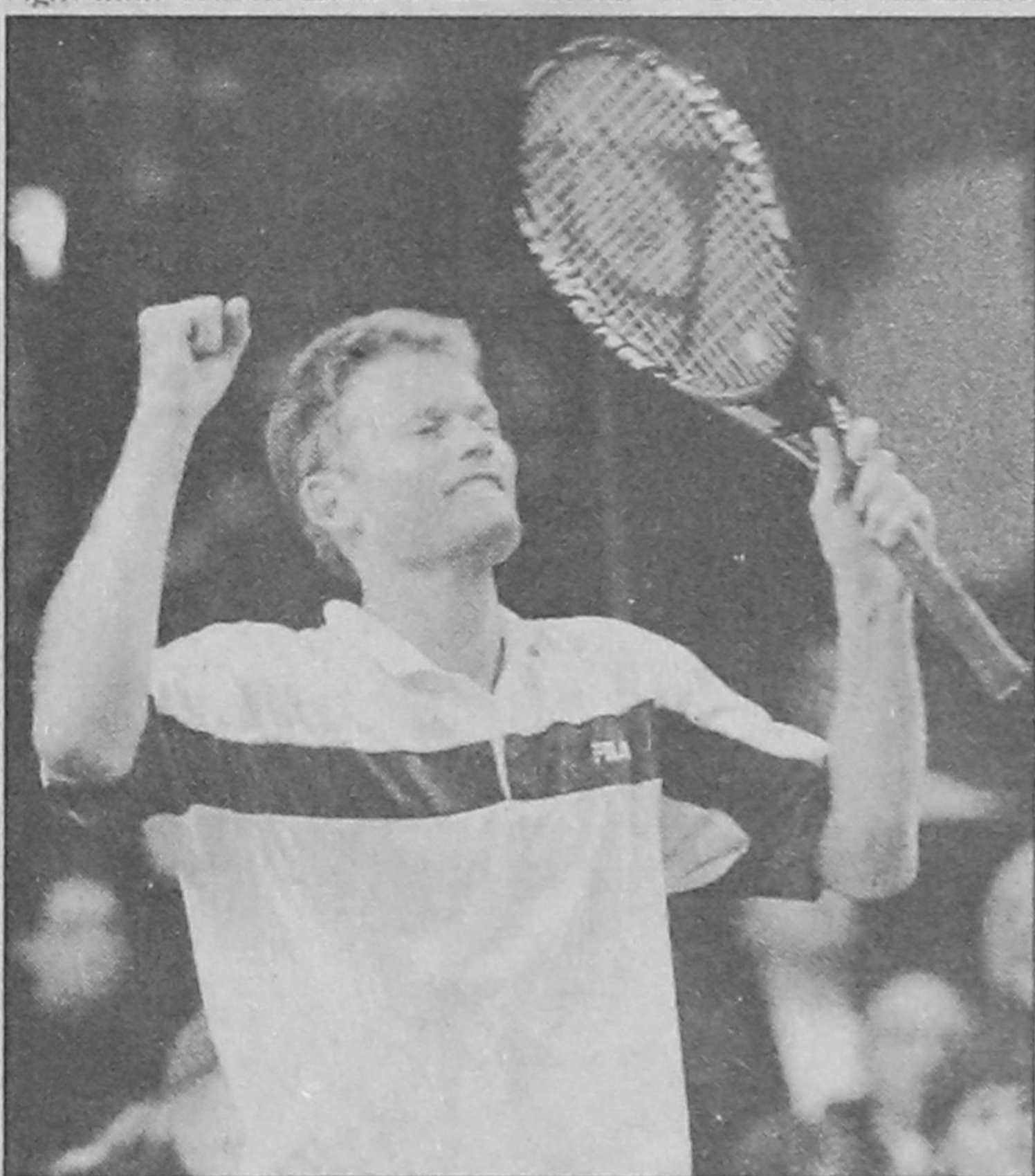
Wayne Ferreira of South Africa celebrates after beating Australian Lleyton Hewitt in the Masters Series final in Stuttgart.

Hewitt moved out to an early break to start the encounter,