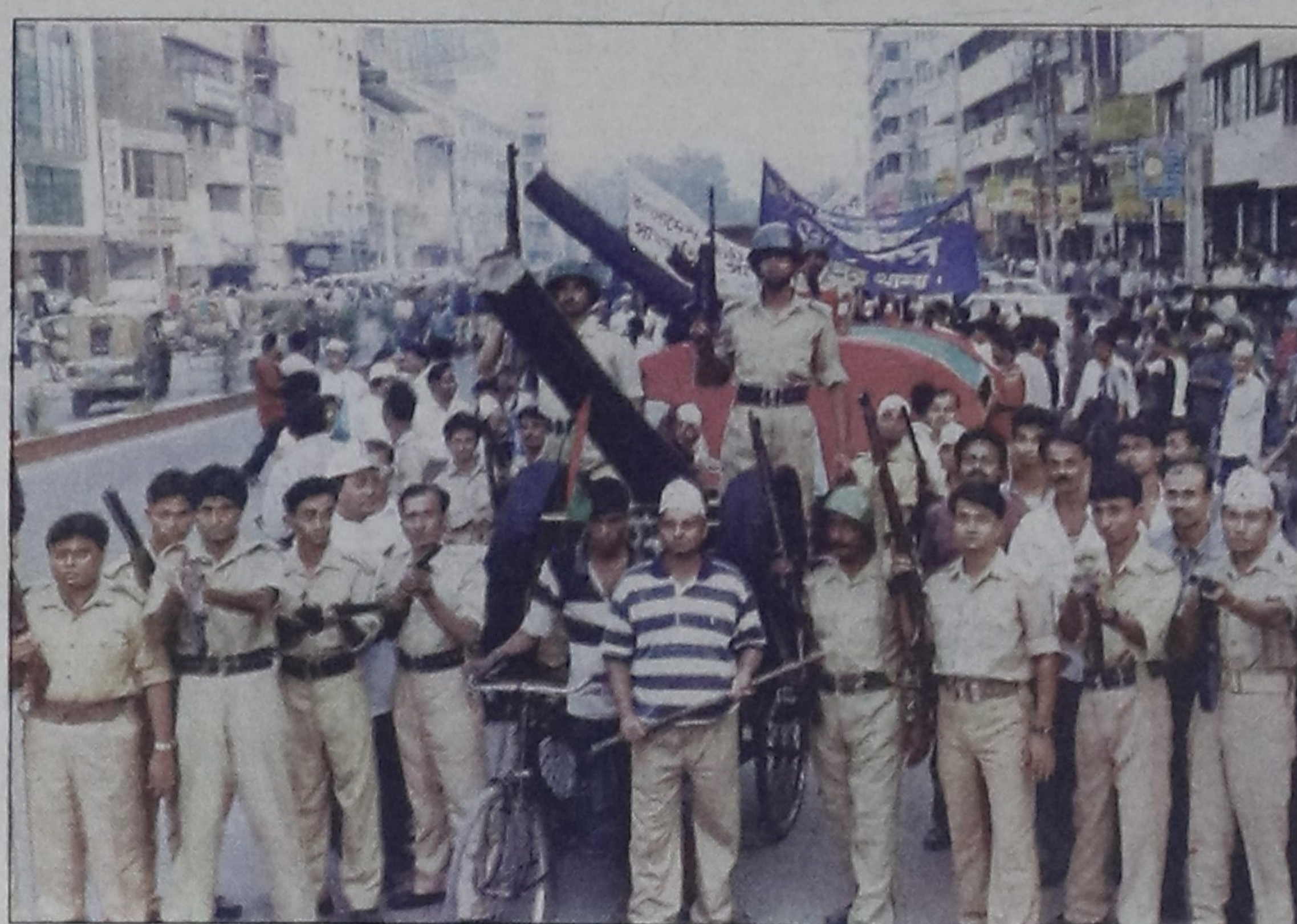
Jatiyatabadi Samajik Sangskritik Sangstha (JASAS), cultural front of BNP, brought out a colourful rally in the city yesterday to mark today's "National Revolution and Solidarity Day".