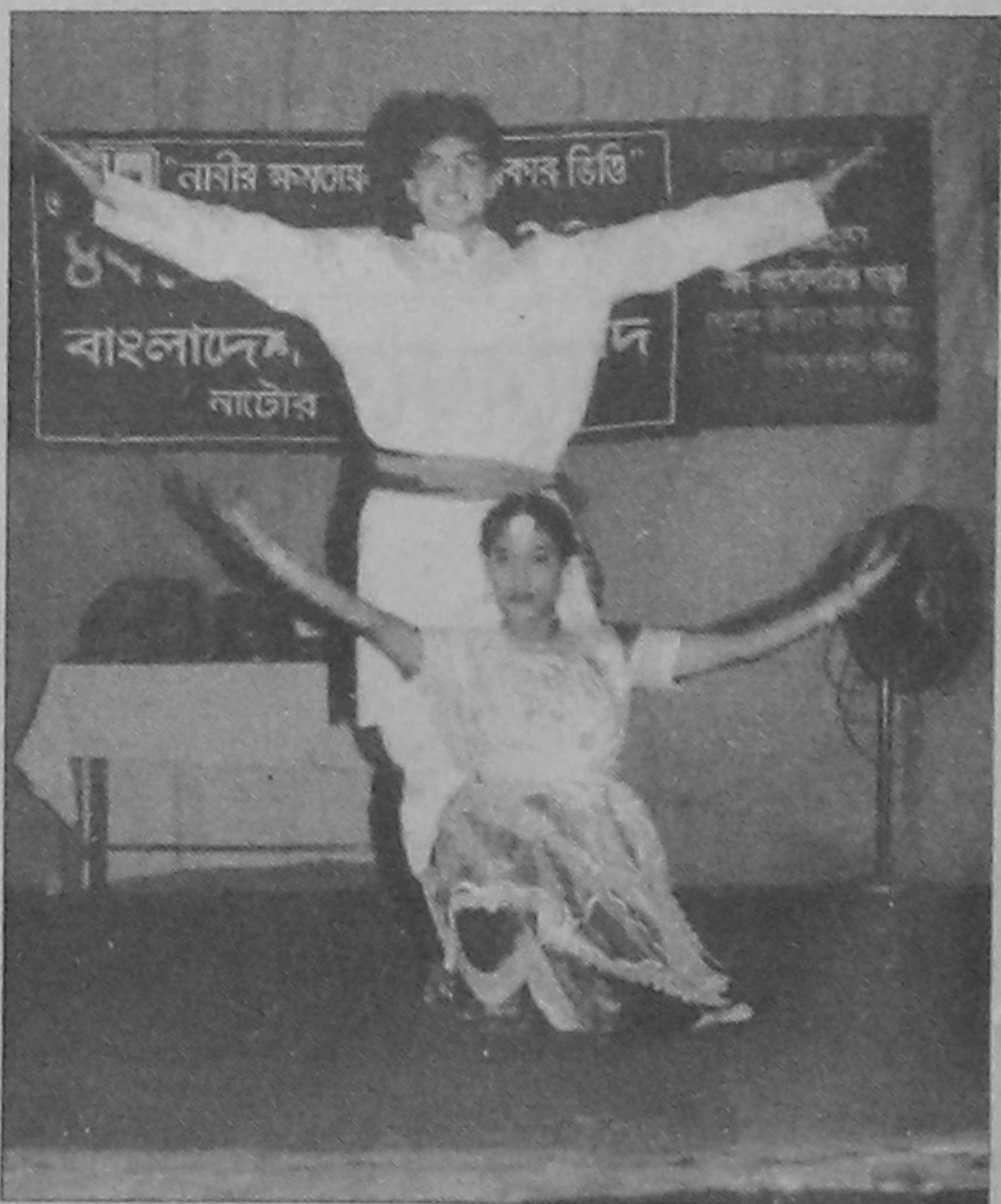
Two local artistes performing dance at a cultural function held at the District Council auditorium recently on the occasion of the fourth district conference of Bangladesh Mohila Parishad, Natore unit.

Acting on a tip-off, Bangabandhu Jamuna Bridge West Thana Police stopped a Sreedpur to Dhaka bound coach and seized 700 bottles of Indian phensidyl. A case was lodged with Bangabandhu Jamuna Bridge West Police Station, but none was arrested in this connection.