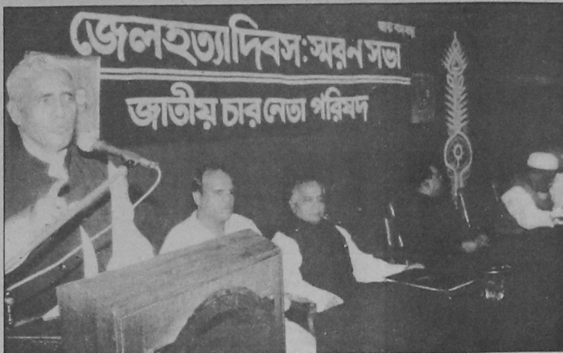
Water Resources Minister Abdur Razzak speaking at a discussion in observance of Jail Killing Day at National Museum auditorium yesterday. Jatiya Char Neta Parishad organised the discussion.

With the increase in the transportation of cargoes by waterways investors do not feel encouraged to invest under the existing laws.