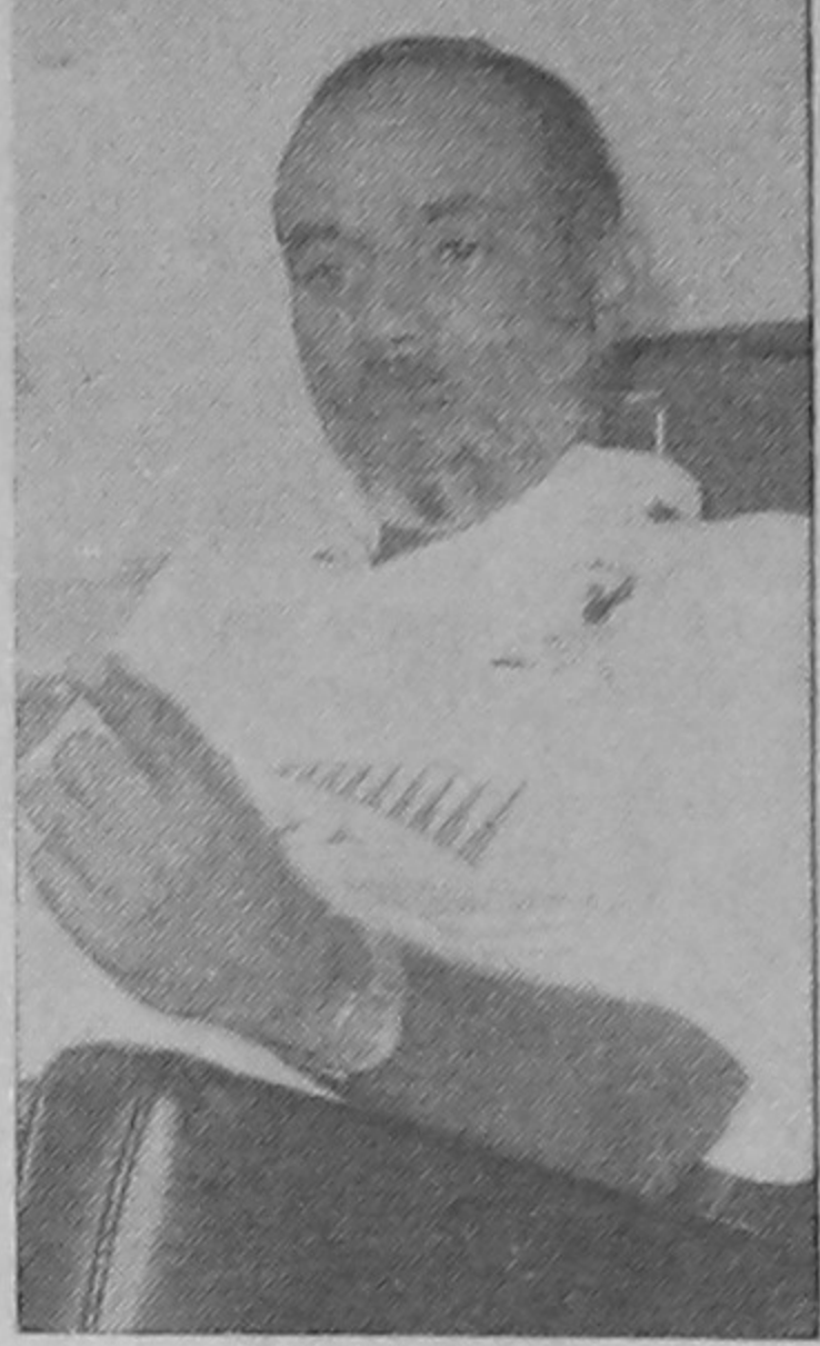
JEFF DUJON the Australian team and depth to the Australian cricket in general."