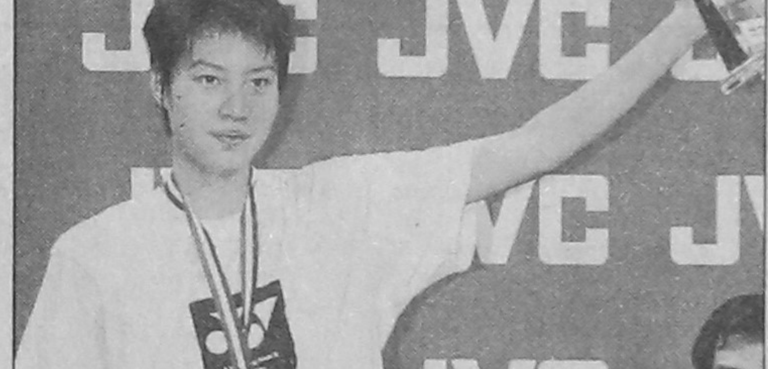
PAY TO LADIES' SINGLES CHAMPION 1000 7500 5th November 2000