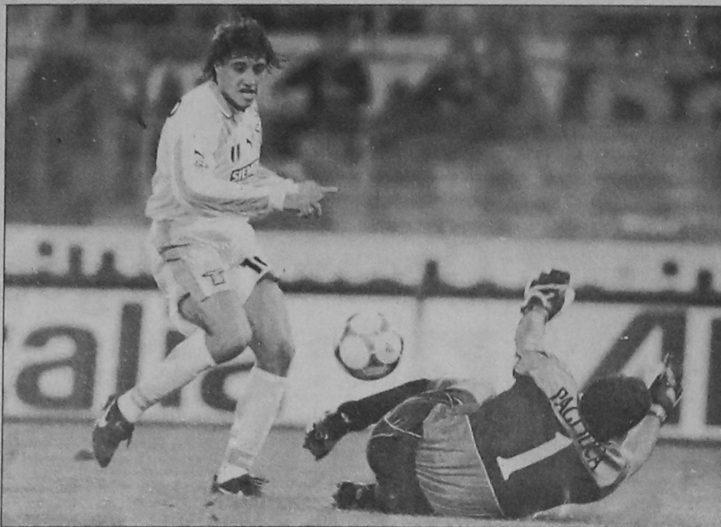
Hernan Crespo, the Lazio super-striker, outsmarting Bologna custodian Gianluca Pagliuca to score during their Serie A match at Rome on November 4.

The ban means McCarthy misses the next two World Cup qualifiers early next year against Burkina Faso and Malawi.