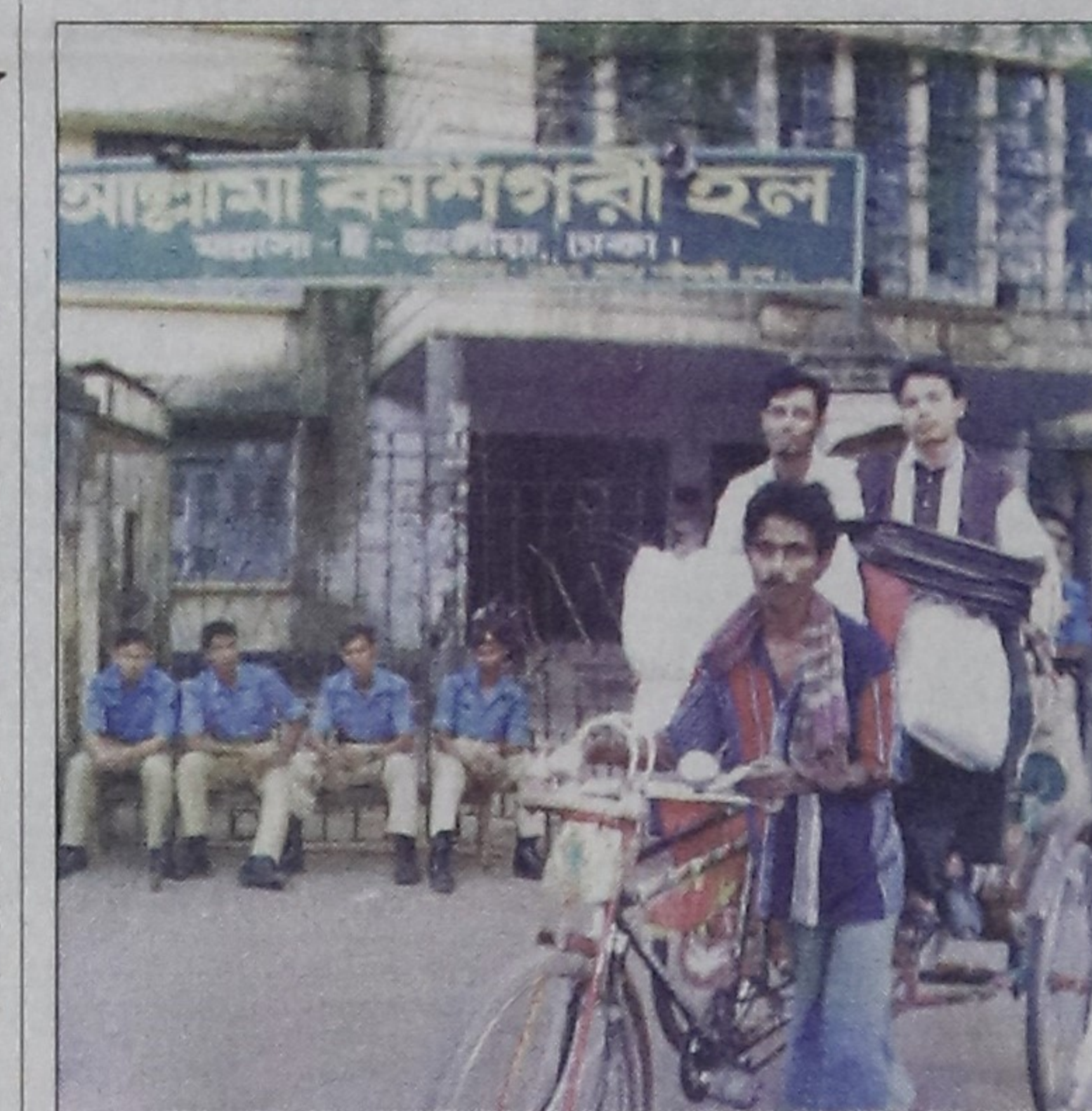
Students of Aliya Madrassah were instructed to vacate their halls of residence following Saturday's skirmishes between two rival factions of the ruling party-backed BCL.

Government action against the two came in the wake of widespread criticism of bungling in relief work following devastating floods that hit Satkhira and other frontier districts.