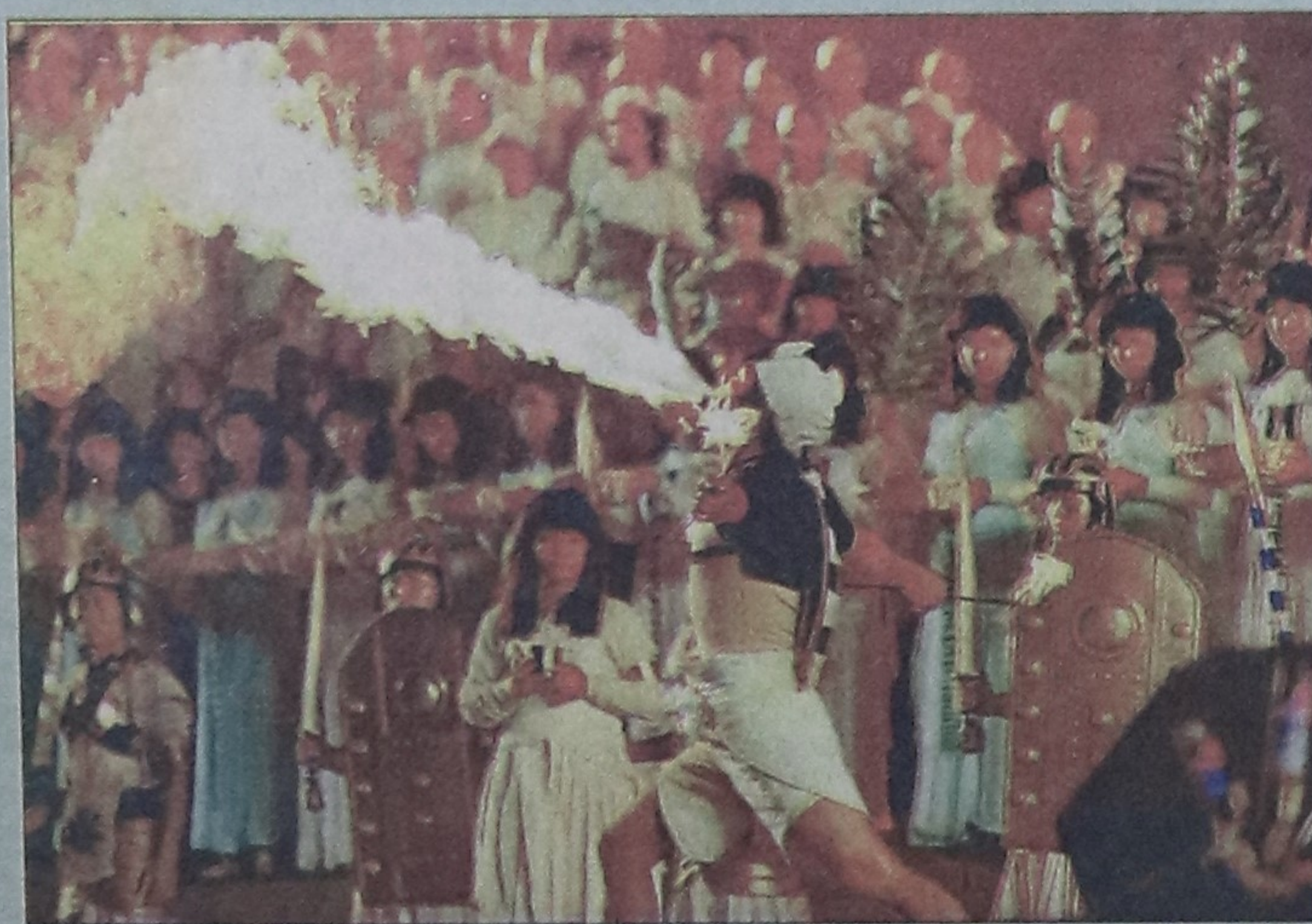
A flame-thrower belches a ball of fire during the spectacular staging of Verdi's Aida in Shanghai on November 3. The performance, which featured a cast of nearly 3,000, is the centerpiece of the city's month-long International Arts Festival.