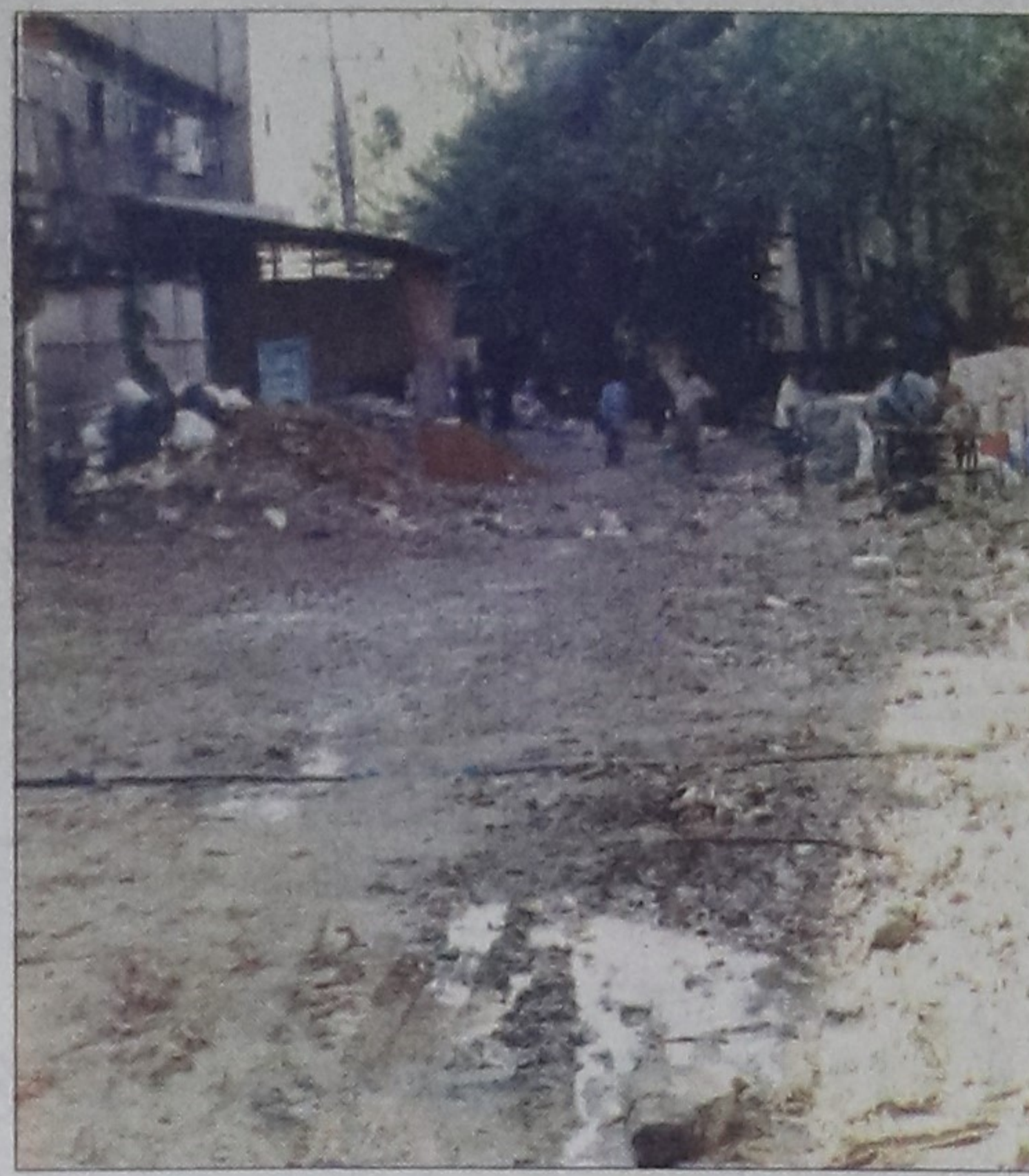
Road or a quagmire?

He said he is very happy to visit Bangladesh and would like to come again.