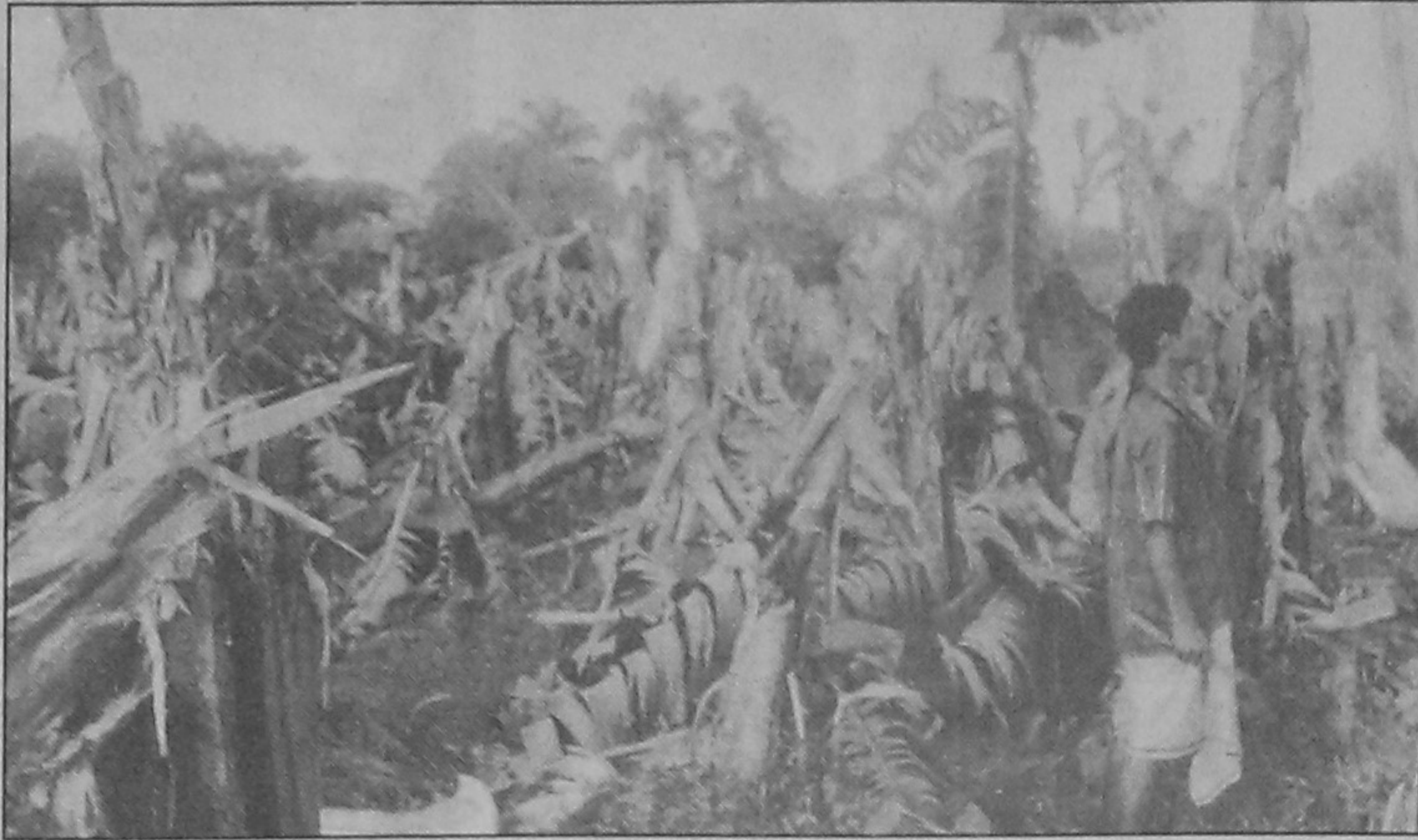
A recent cyclonic storm has damaged crops on a vast tract of land in Jhenidah district. Photo shows a farmer at village Hazampara under Saikkupa upazila observing his banana plants which were badly affected by the storm.

Jhenidah is widely known as banana and vegetables producing area in the country. At least 40 per cent of the total production of the district are sent to Dhaka.