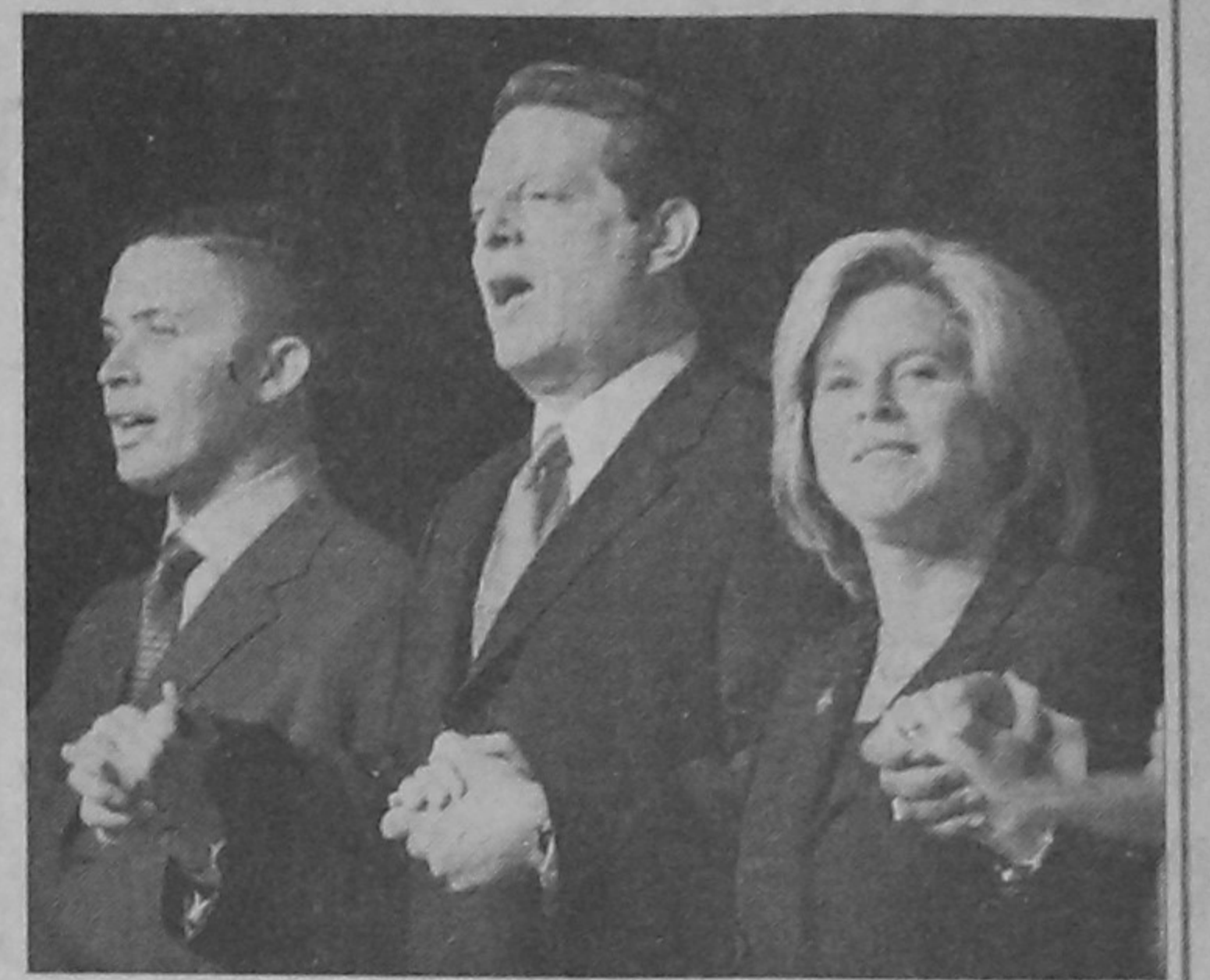
Democratic presidential candidate and US Vice President Al Gore sings "We Shall Overcome" at the Tennessee Democratic Victory Interfaith Prayer Breakfast in Memphis, Tennessee, on Saturday with his wife Tipper and US Rep. Harold Ford.