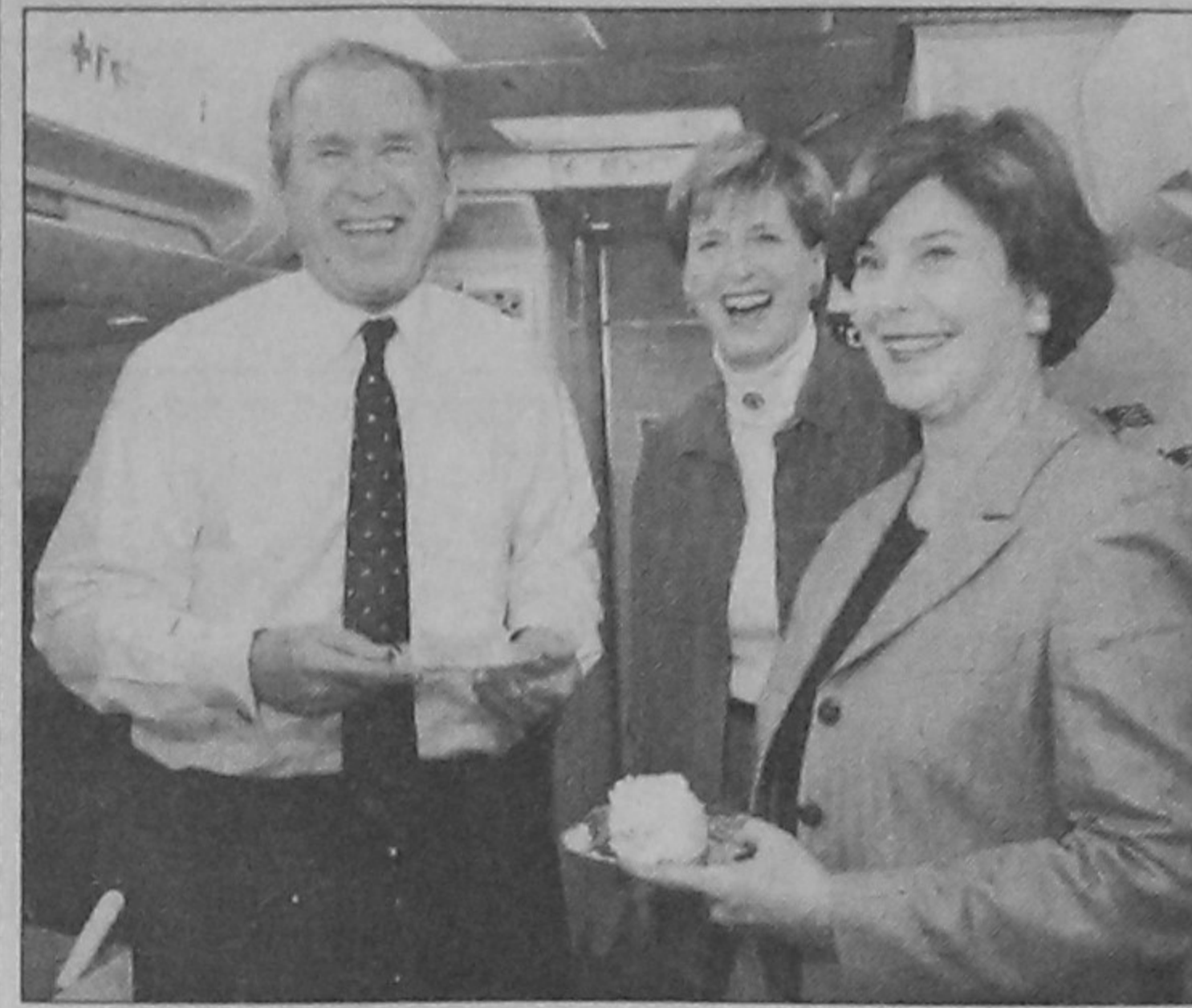
Republican Presidential candidate Texas Governor George W. Bush shares cake with Laura Bush (R) on her birthday aboard Bush's campaign airplane on the way to New Jersey. Laura turns 54 on Saturday.