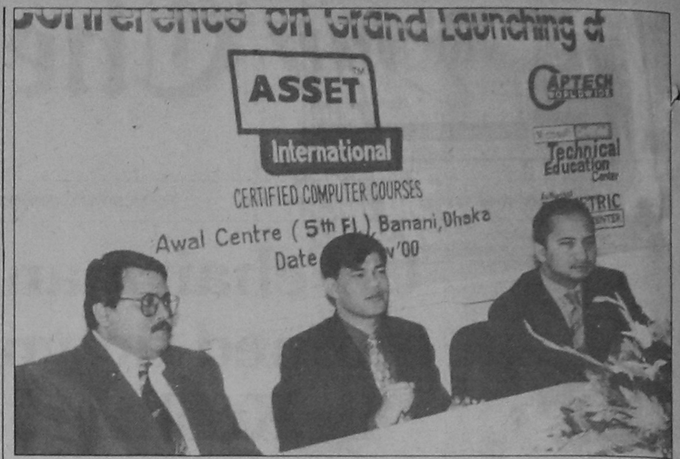
Aptech held a press conference in the city yesterday to mark the launching of the Aptech School for Software Export Technologies (ASSET) courses at its Baman Centre.