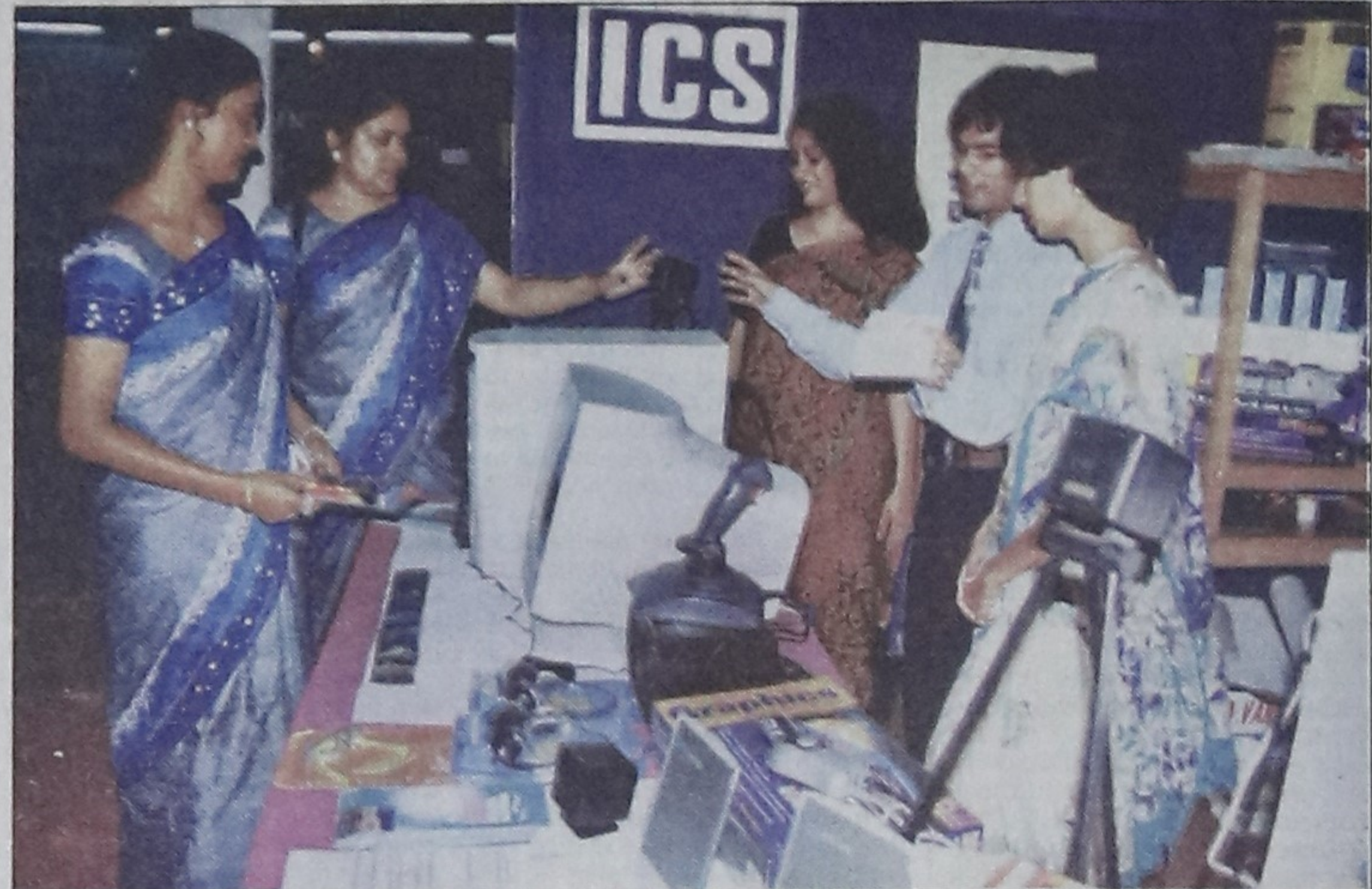
A three-day Mega Expo 2000, organised by Conference and Exhibition Management Services (CEMS), began at Sheraton Hotel yesterday. Three different exhibitions titled Comptexpo, Elexpo and ConExpo are being held under the unified banner.

A case was filed with Demra thana in this regard.