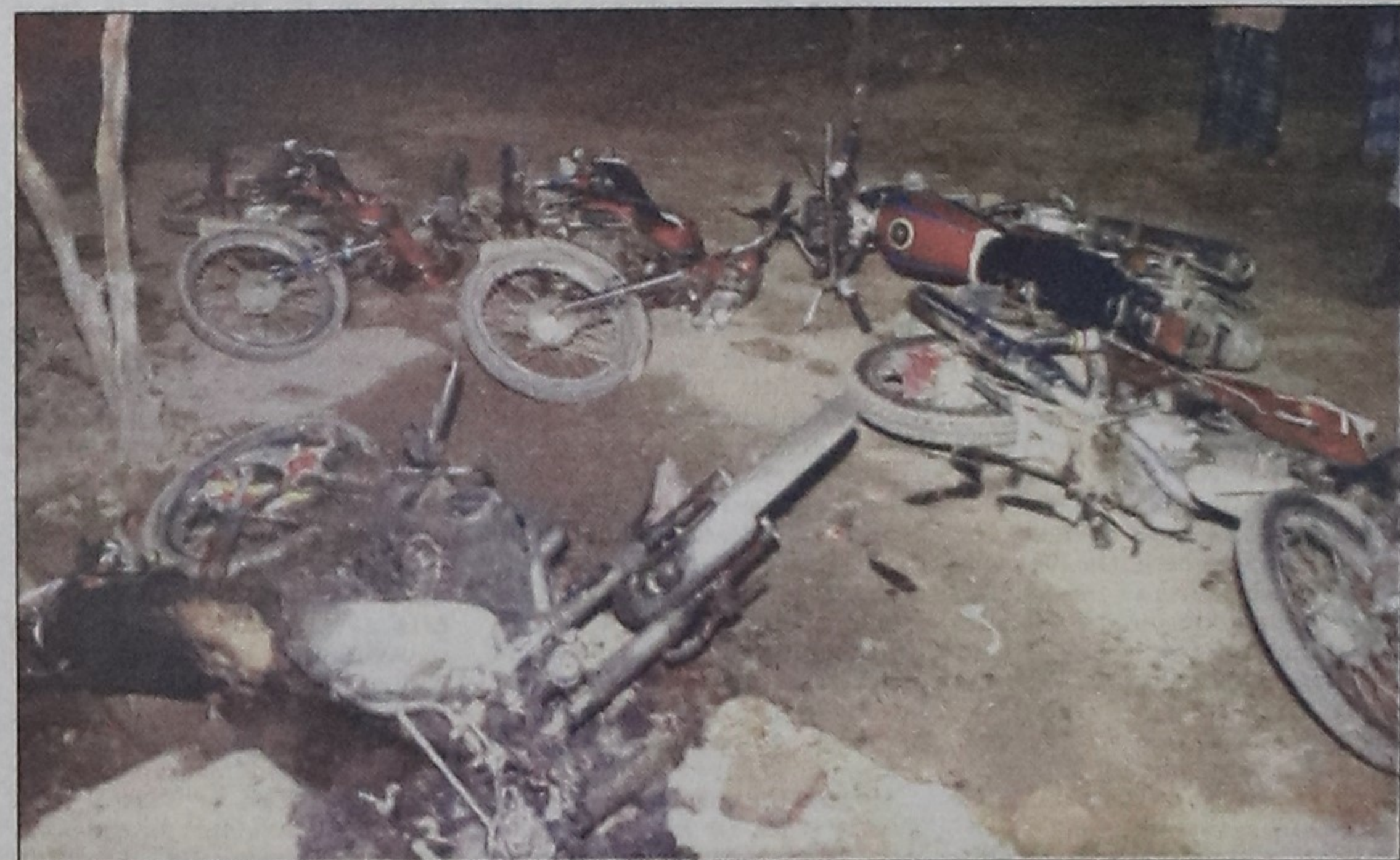
Activists of Islami Chhatra Shibir raised hell at the Aliyah Madrassah yesterday, ransacking the principal's office and setting a few motorbikes afire.