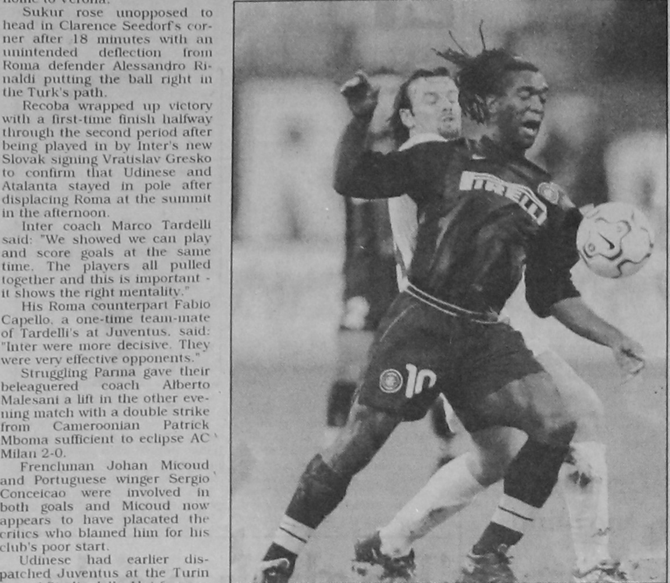
Inter Milan's Dutch international playmaker Clarence Seedorf is under pressure from AS Roma's Cristiano Zanetti during their Serie A clash at Milan on November 1.