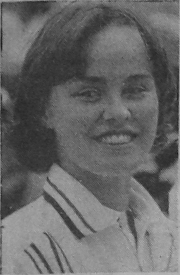
Martina Hingis (Swiss tennis star) "I think I have found out what is necessary to beat the power players." After defeating Lindsay Davenport in the final of the Swisscom Challenge.