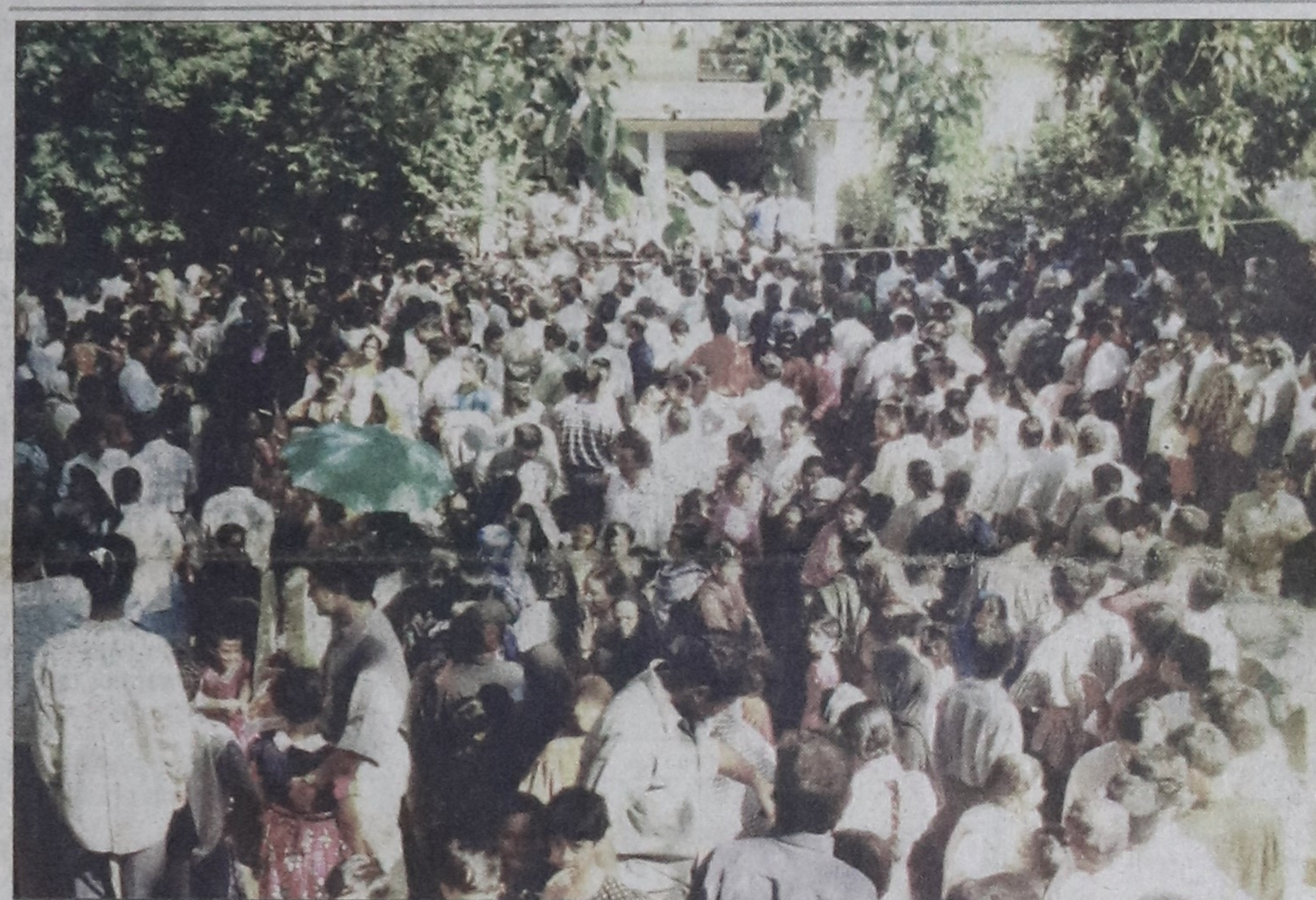
Annual ordeal... parents crowd the premises of Viqarunnisa Noon School to collect forms two months before the admission tests.