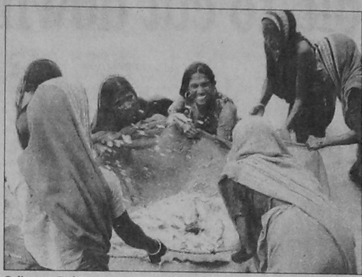
Collective Fishing - September 1993

The exhibition showcases 49 black and white and coloured photographs. Open till November 9, 2000 from 9 am to 12am and 5pm to 8pm daily (Saturday 5pm to 8pm) at the Alliance Francaise de Dhaka, the show is a fantastic narration of the status of our rural women and their sincere efforts to change their lot.