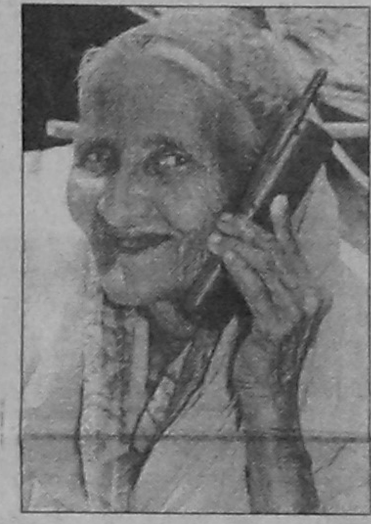
Even Latest Technology Comes in Handy - March 1997