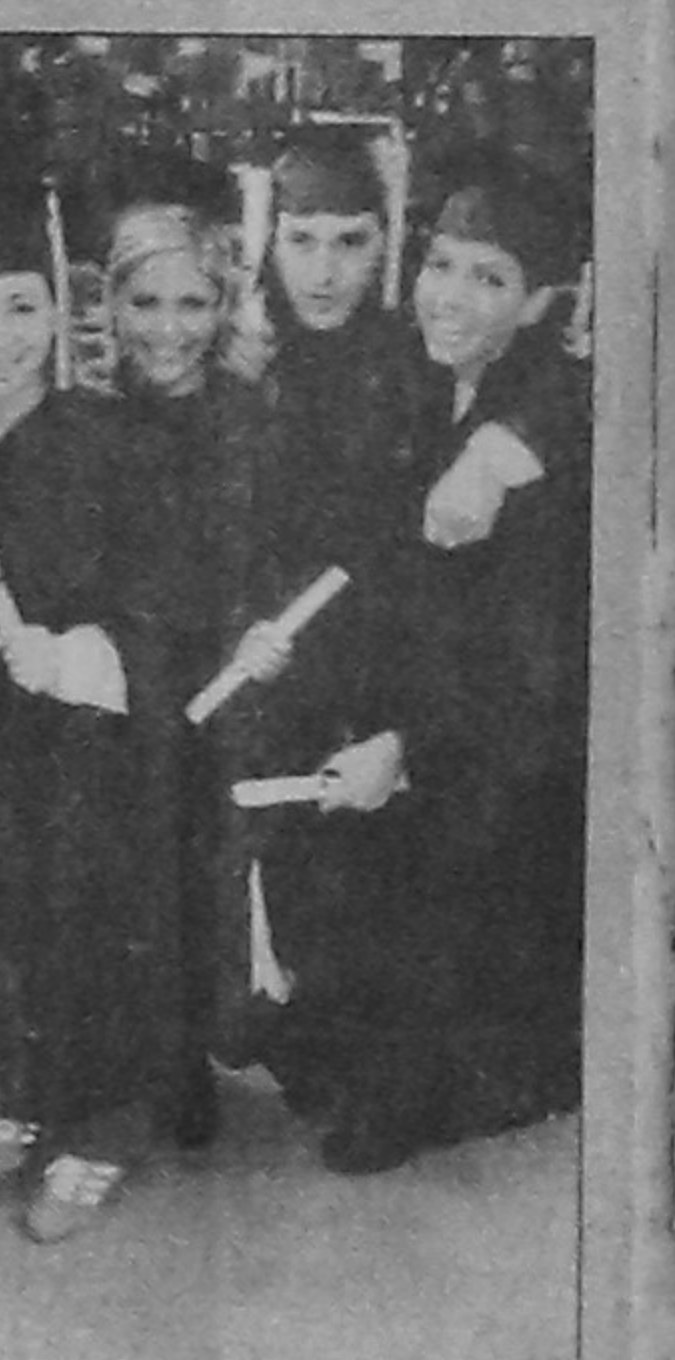
Buffy the Vampire Slayer on Star World tonight at 10

Stuttgart Pres. By Eurocard Stuttgart, GERMANY Early Round Coverage Day 4:00 Nba Basketball New York, NY USA- Philadelphia 76ers Vs New York Knicks 6:30 Nba Basketball Portland, OR USA- Los Angeles Lakers Vs Portland Trailblazers 12:00 Extreme Sports- DK Dirt Circuit Series Las Vegas, NV USA 12:30 Baseball Max 1:00 Live- Sportcenter Bristol, CT USA 2:00 Tennis Masters Series By Eurocard Stuttgart, GERMANY Early Round Coverage Day #2 11:00 Italian Serie A 2000/2001 1:00 Auto Racing- Motorsport Asia