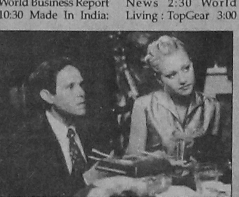
Ally McBeal on Star World tonight at 11