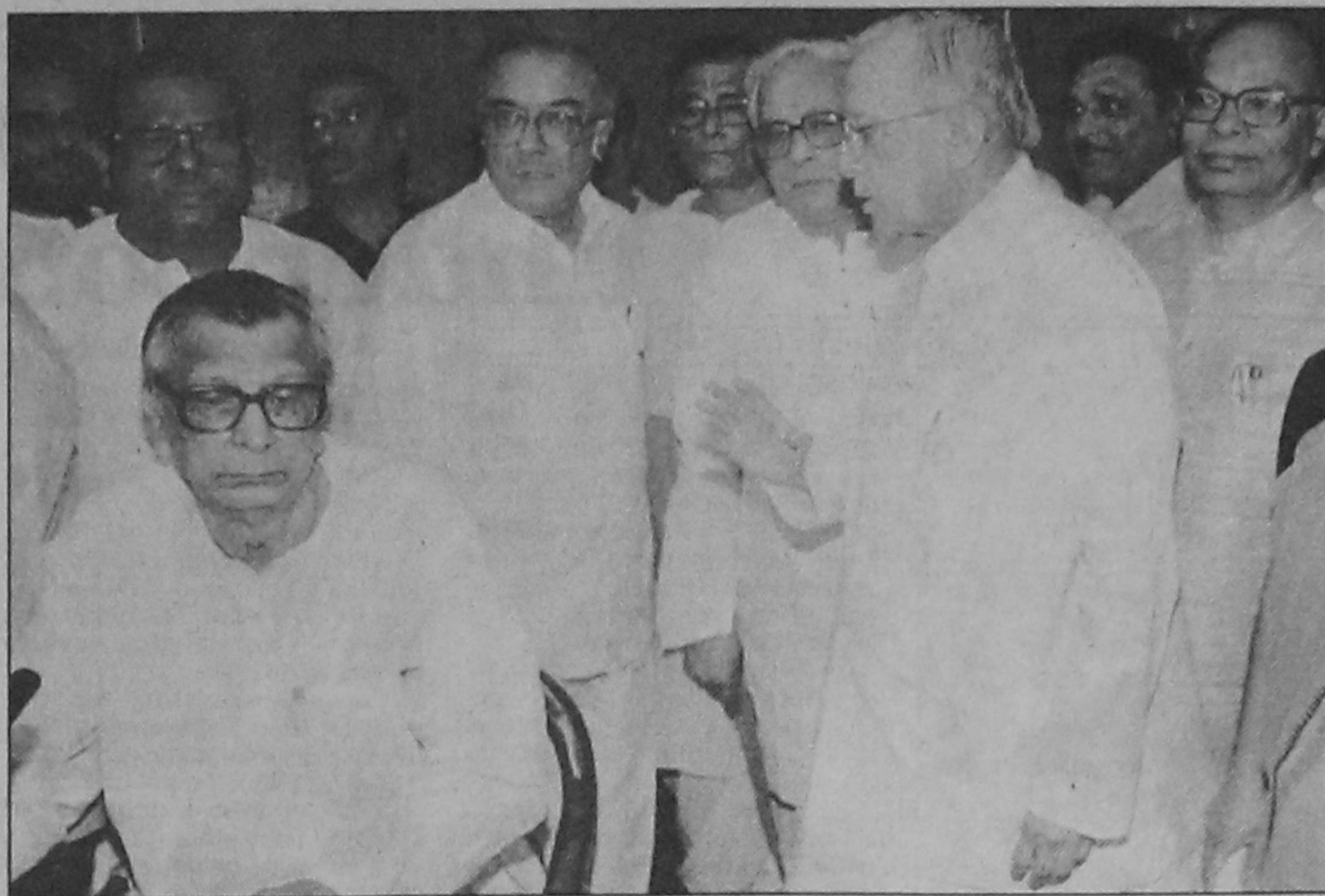
West Bengal Chief Minister Jyoti Basu (2 nd from R) gestures as he speaks to his cabinet colleagues after attending the last cabinet meeting of his twenty-four year tenure as the state Chief Minister in Calcutta yesterday. State Home Minister Buddhadev Bhattacharya (3 rd from R) will replace Basu as the new Chief Minister after the latter retires on November 6 on health grounds.

"The moment a civilian set-up is established a systematic campaign of sabotage is started to undermine the authority of that government," he said.