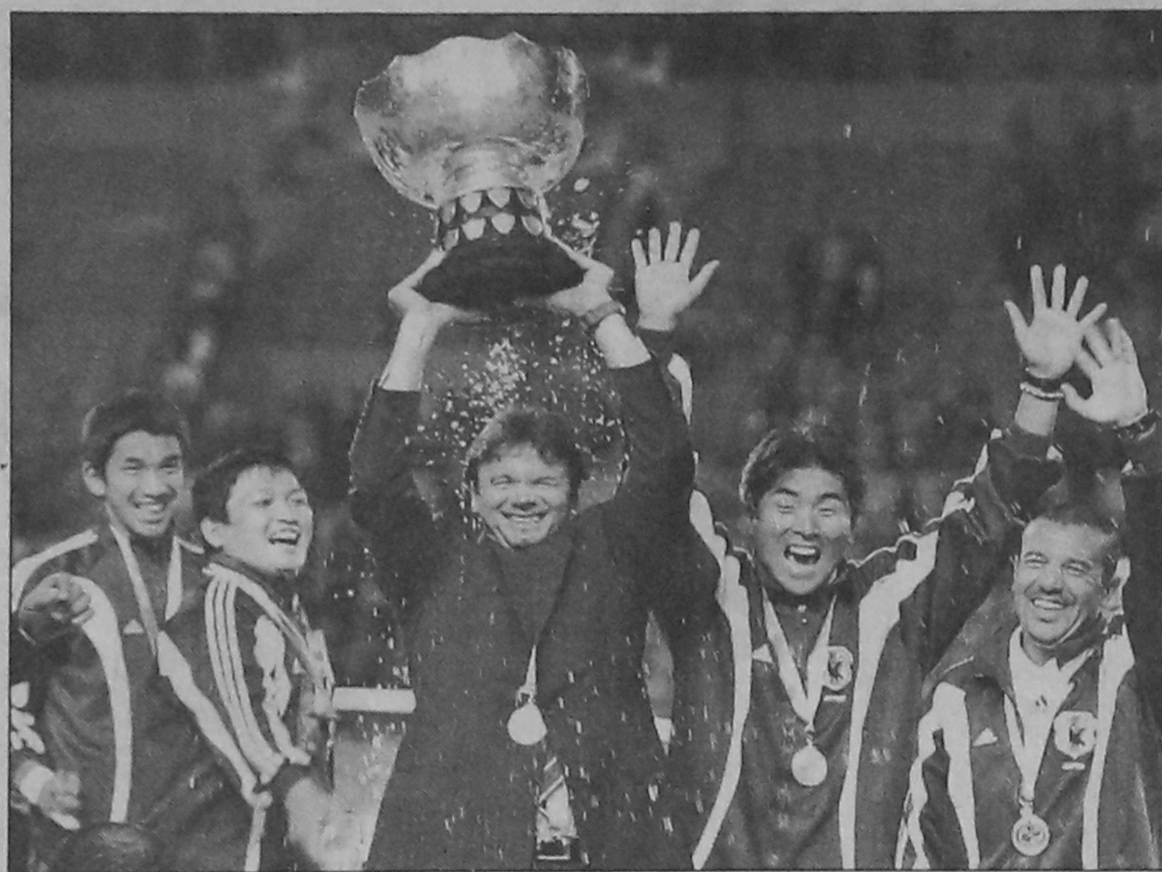
TROUSSIER TRIUMPHS: A delighted Japan coach Philippe Troussier holds aloft the Asian Cup during the presentation ceremony.

South Korean striker Lee Dong-Gook finished topscorer with six goals after netting in his team's 1-0 victory in the third-place playoff win over China earlier on Sunday.