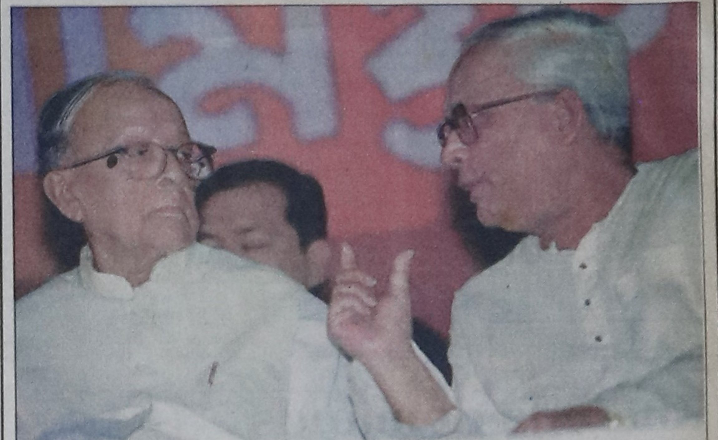
West Bengal Home Minister Buddhadev Bhattacharya (R) gestures as he speaks to Chief Minister Jyoti Basu at a Left Front rally in Calcutta yesterday. Bhattacharya will replace Jyoti as the new Chief Minister from November 6 after the latter retires from the post next month on health reasons.