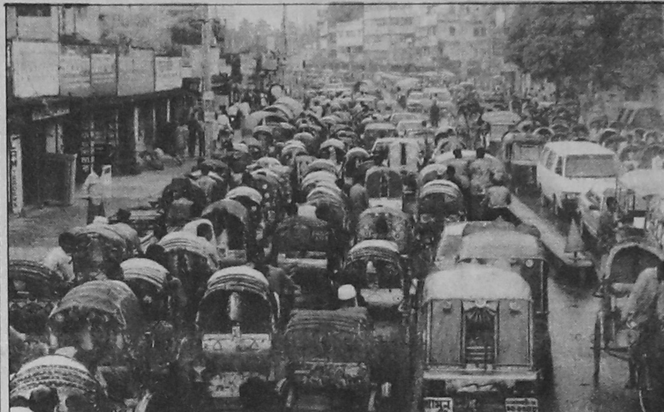
City life became normal yesterday after a day of downpour and the usual traffic jam, here in Shahjahanpur area, reigned supreme on the roads.

All concerned have been requested to attend the meeting on time.