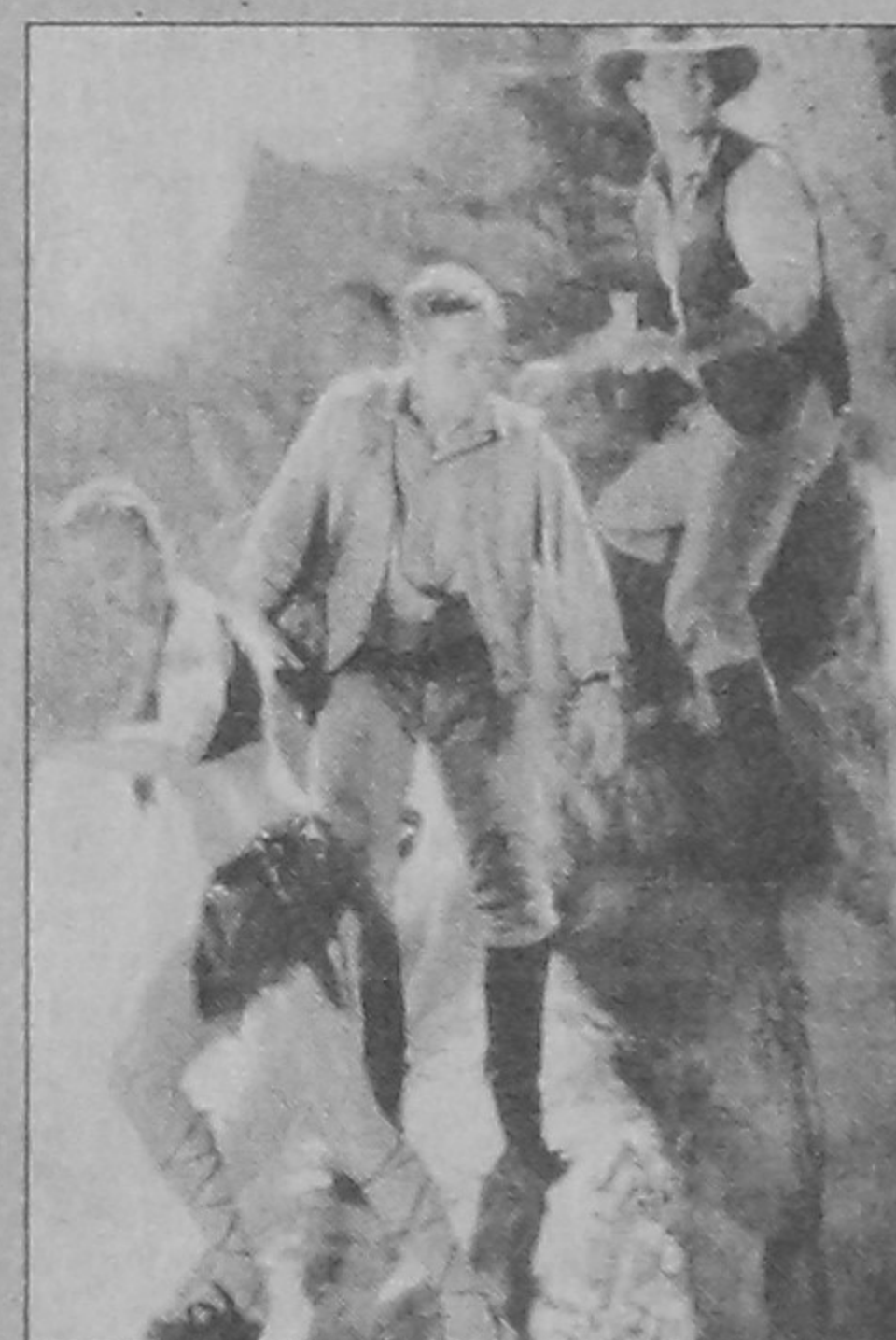
Sir Arthur Conan Doyle's The Lost World on Star World at 1:00p.m.

Camped in the mountains, Roxton and Marguerite are taken by surprise by Norse Warriors. Roxton is run through a sword and Marguerite is abducted. Near death Roxton is visited by a mystical young boy named Osric, who offers a deal. Meanwhile, Malone and Veronica must defend the tree house from a band of cut-throats who will stop at nothing to take it from them.