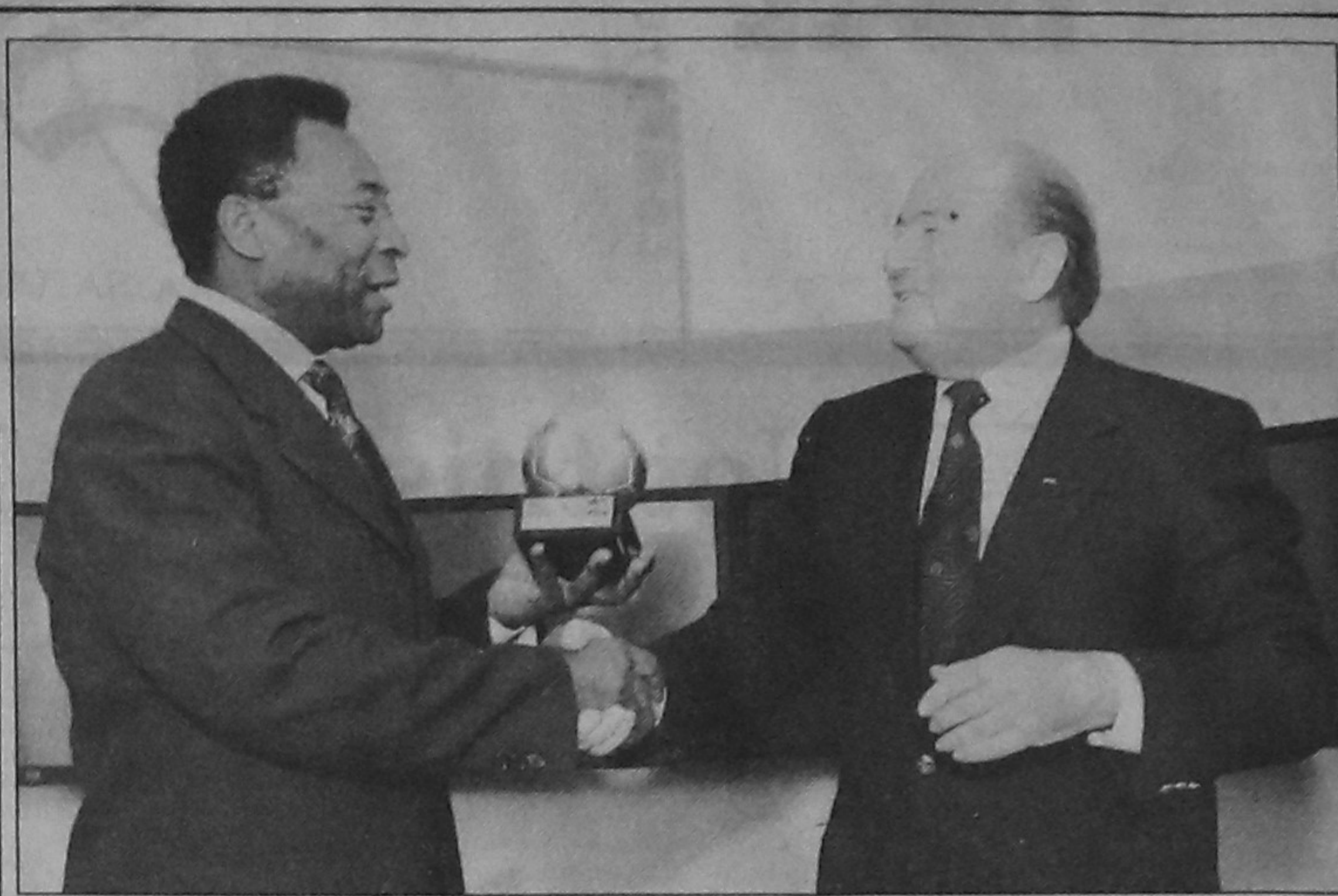
FIFA'S BIRTHDAY GIFT FOR THE GREATEST : FIFA President Sepp Blatter presenting Pele with a trophy on the occasion of the football legend's 60th birthday at Zurich on October 26.

In the opening match, Shaheed Hamid Dilu Sangsad will take on Antola Club at 3 pm.