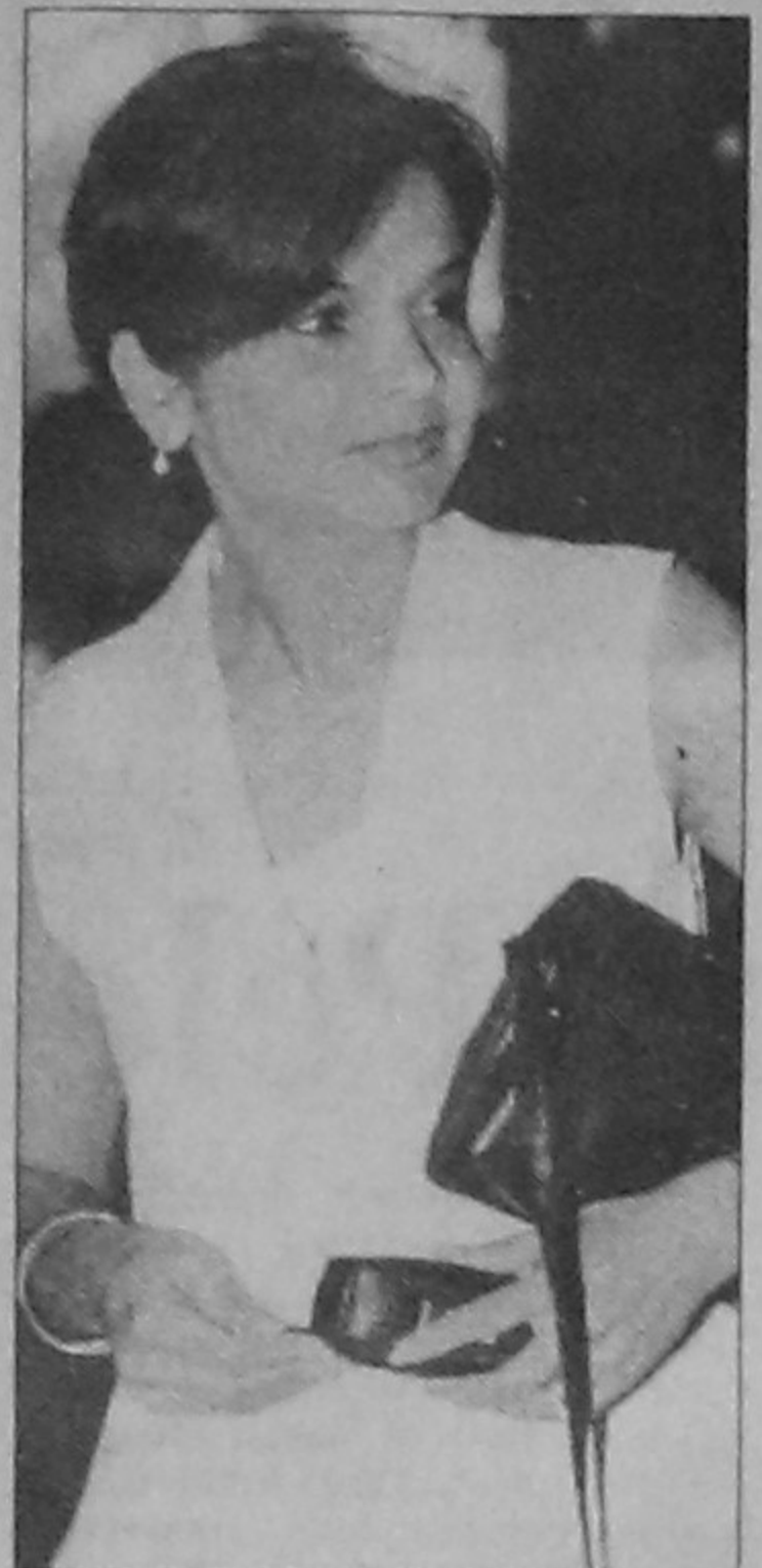
Shamila Batohi (Chief prosecutor of the King Commission of Inquiry) "I think he was a good captain and a wonderful player for South Africa over the years." On Hansie Cronje.